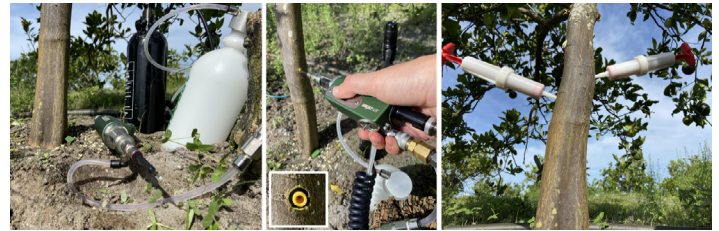
Figure 3. Equipment needed for high-pressure injection (left). High-pressure injection requires a plastic plug, which may remain in the tree after injection (center). Medium-pressure injection using a spring-loaded syringe that is removed after the material has been taken up (right).

The ArborJet Quik-Jet Air (ArborJet Inc, MA, Woburn, USA), is one example of a high-pressure injection device. This system uses 7.15 mm or larger diameter plastic plugs, which are inserted into the tree after drilling a hole. The plugs create a tight seal for injection, prevent leaking, and reportedly protect the wound from pathogens and insects. Injection of the compounds occurs through these injection plugs at pressures of 60–100 psi and requires compressed gas. Although the plugs enable the rapid injection of large volumes of material, they increase the size of the injection hole and, if left in place, interfere with the natural healing of the wound.