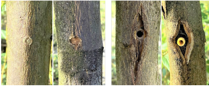
Figure 4. Wounds induced by low-pressure injection generally heal well and close completely (left). Wounds induced by injection of some materials (here oxytetracycline) and by high-pressure injection may not close and often result in extensive bark cracking (right).

1500 ml enema bag, tubing, and other necessary infusion port parts (Crane et al. 2014).