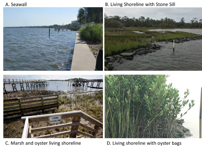
Figure 1. Examples of different types of shoreline stabilization. Credits: A: Seawall photo by A. Smyth; UF/IFAS; B: Living shoreline with stone sill by S. Barry, UF/IFAS; C: Oyster and marsh living shoreline at Cedar Key, FL by UF/IFAS; D: Living shoreline with oyster bags by S. Barry, UF/IFAS

processes that occur in nature and can be measured in the laboratory. Ecosystem functions that benefit humans are ecosystem services.