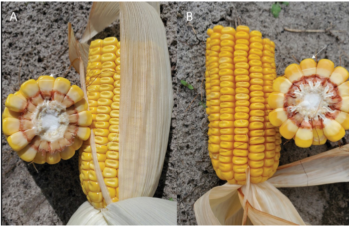
Figure 5. Corn ear at about (A) 3/4 milk line and (B) corn ear at about 1/2 milk line, approaching harvesting time.