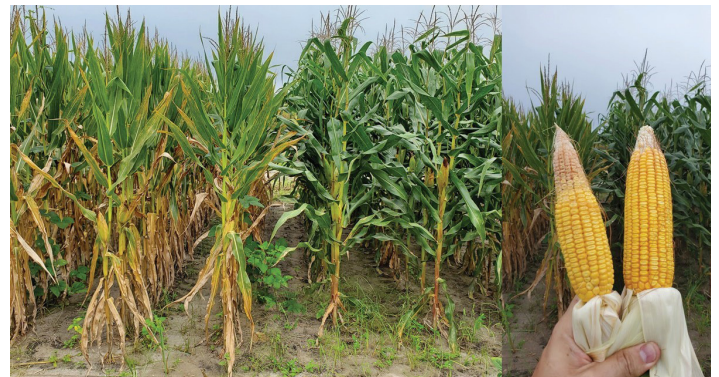
Figure 2. Differences in disease resistance between two corn hybrids (left) and resulting effect on ear fill (right).

suffer from root, crown, stalk, and ear rot diseases. The latter is of high importance for silage as it can produce mycotoxins which are detrimental to cattle health or even lethal. Choice of hybrid will have the greatest impact on disease prevention (Figure 2). Disease issues tend to be greater on the second summer crop because of buildup of inoculum and more favorable environmental conditions (humid and hot weather). Like insects, pathogens evolve and adapt to new conditions, genetic pressure, and chemicals. Therefore, it is important to manage diseases carefully, rotate fungicide modes of action, and choose hybrids currently tolerant to the most problematic pathogens. Older materials and practices previously used may not be effective at controlling current pathogens. As a rule of thumb, fungicides should be applied (if needed) around vegetative tassel until reproductive growth stage R1. At this point, 60% of grain fill will come from the leaves that arise from the ear and up. Field scouting is necessary to gauge whether or not there is 5% or more of the ear leaf lost to disease lesions. If you have 5% of the ear leaf covered in lesions at vegetative tassel, a fungicide application will result in yield gain that is equal to or greater than the cost of the application. The most common diseases in Florida affecting silage production are listed in Table 1.