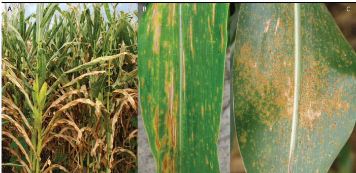
Figure 3. (A–B) Southern corn leaf blight and (C) southern rust on corn.

by southern rust, but late-planted corn is at high risk. Corn ipmPIPE keeps an updated map each year to help track the spread of this disease. This map can be accessed via https://corn.ipmpipe.org/southerncomrust/ .