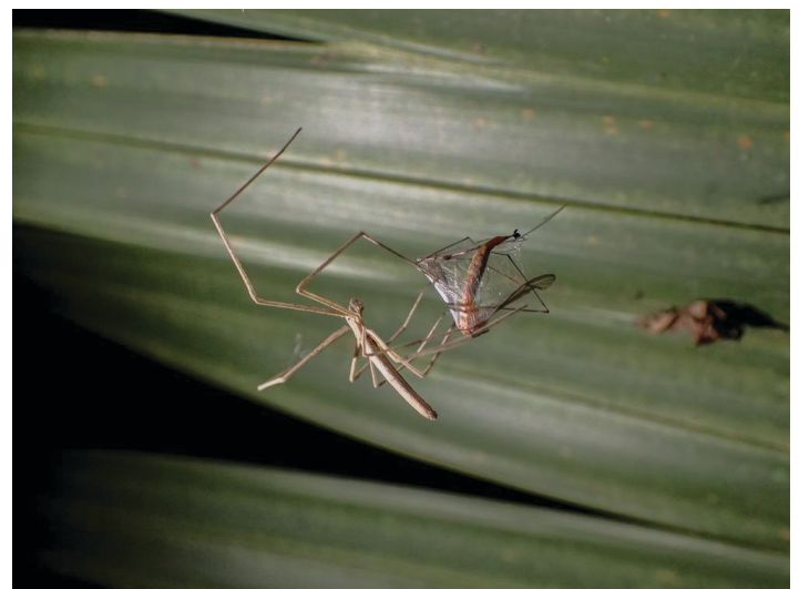
Figure 4. Deinopis spinosa (Marx) capturing a crane fly and wrapping it in silk.