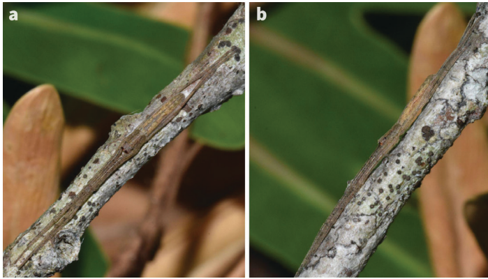
Figure 2. Deinopis spinosa (Marx) exhibiting cryptic posture and form from a) dorsal view and b) lateral view.

the mature male can be distinguished by its large, bulbous pedipalps, extremely thin abdomen, and exceptionally long legs (Blest and Land 1977). During the day, when resting in their twig-like posture, they look superficially like other twig-like spiders (e.g., Miagrammopes spp. (family Uloboridae), Tetragnatha spp. (family Tetragnathidae)). However, these other spider groups all have relatively small eyes, compared with the unmistakably large forward-facing eyes of Deinopis spinosa .