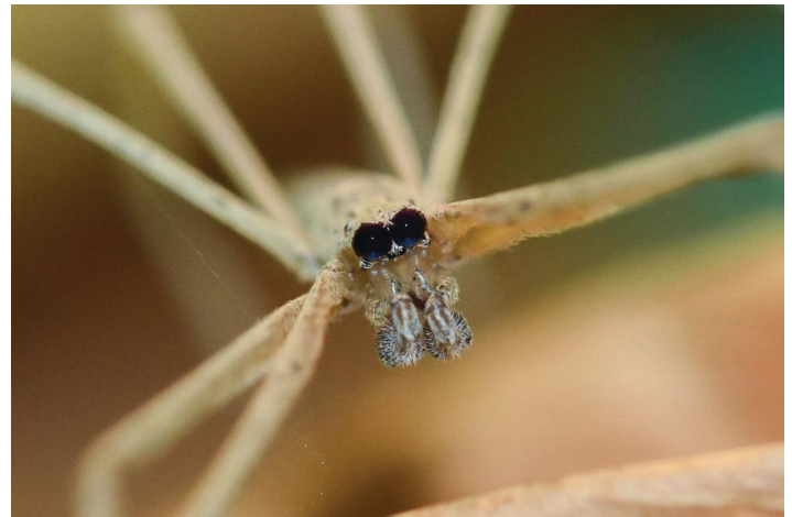
Figure 1. Anterior view of male Deinopis spinosa (Marx) showing the large posterior median eyes.

at night (Land and Nilsson 2012). Relative to body size, the diameter of the posterior median eye is significantly smaller in mature males compared to immature males and females of all life stages (Stafstrom et al. 2017).