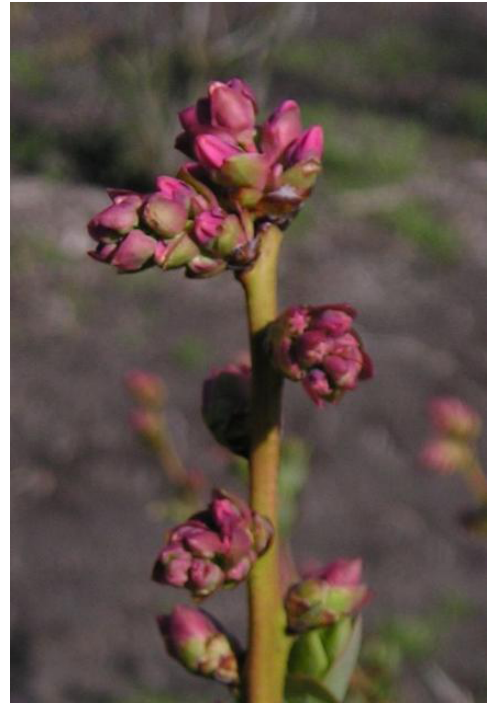
Figure 4. Flower bud stage 4.