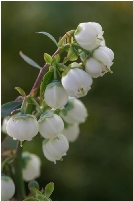
Figure 6. Flower bud stage 6.