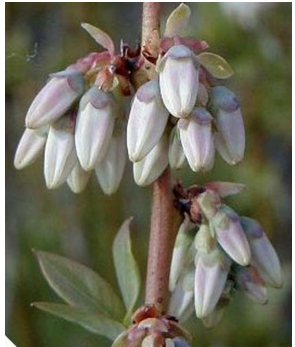
Figure 5. Flower bud stage 5. Credits: Mark Longstroth (Michigan State University Extension)