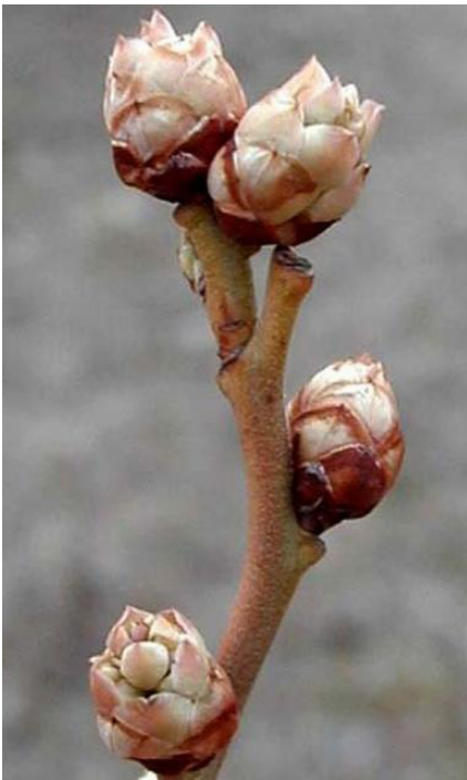
Figure 3. Flower bud stage 3.