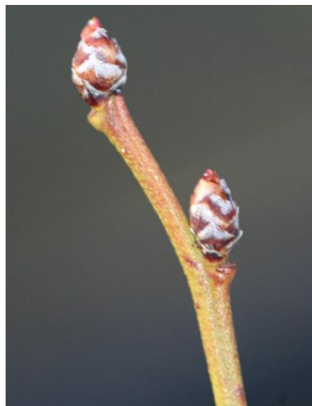
Figure 1. Flower bud stage 1.