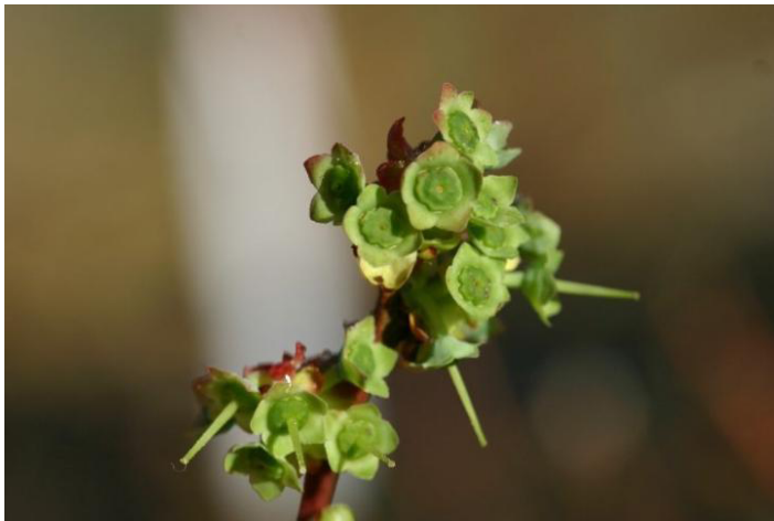
Figure 7. Flower bud stage 7.