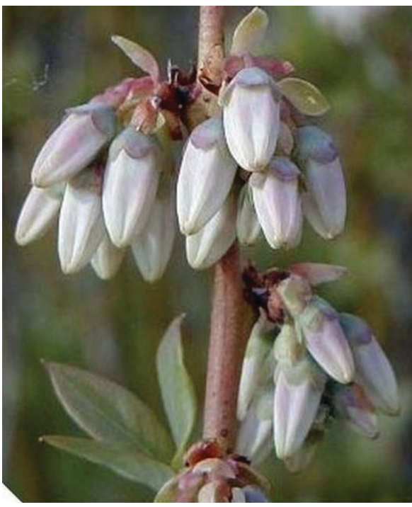
Figure 5. Flower bud stage 5.