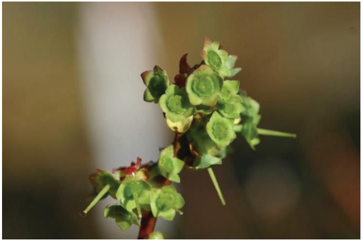
Figure 7. Flower bud stage 7.