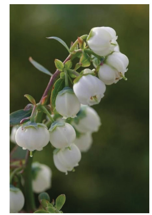
Figure 6. Flower bud stage 6.