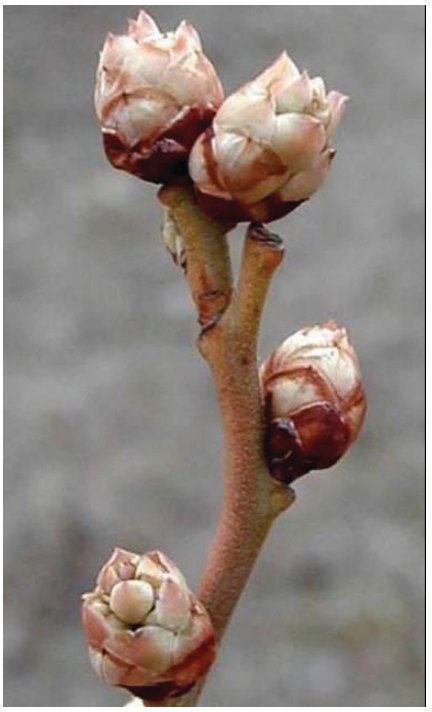
Figure 3. Flower bud stage 3.