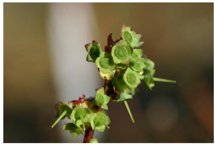
Figure 7. Flower bud stage 7.