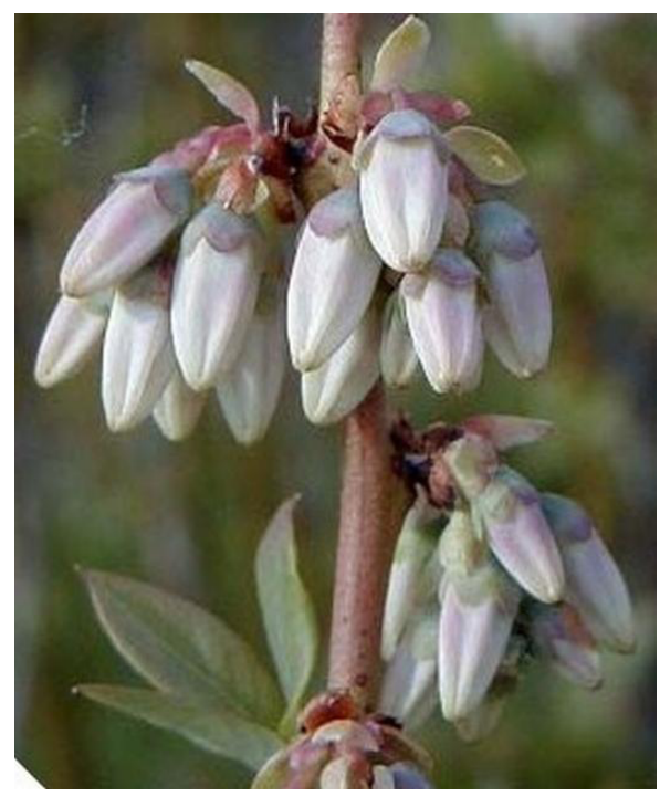
Figure 5. Flower bud stage 5.