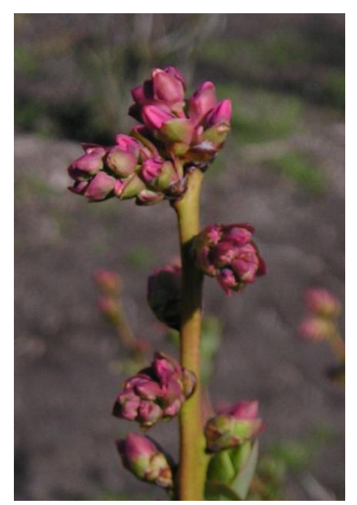
Figure 4. Flower bud stage 4.