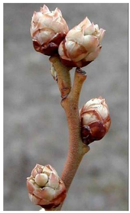
Figure 3. Flower bud stage 3. Credits: Mark Longstroth (Michigan State University Extension)