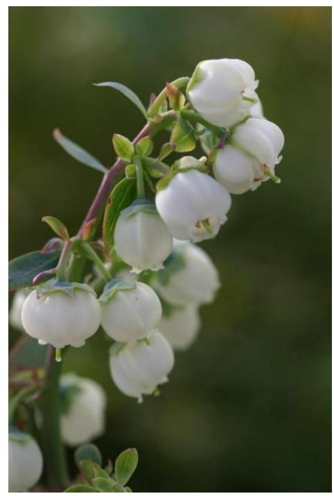
Figure 6. Flower bud stage 6.