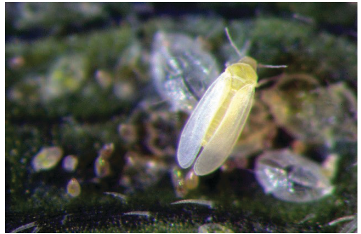
Figure 3. Whitefly, Bemisia tabaci Gennadius, adult.