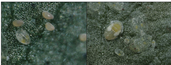
Figure 2. Whitefly, Bemisia tabaci Gennadius, immature stages.