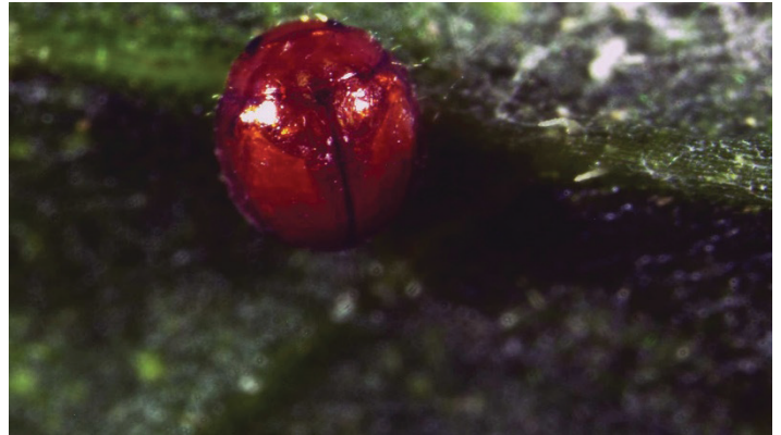
Figure 4. Predatory beetle, Delphastus pallidus adult.

for the two biotypes may vary, it is important to determine the whitefly biotype before applying any chemical in the affected region. The contact information for the laboratory authorized to biotype whiteflies in Florida is presented below. Density levels requiring treatments vary depending on factors including the crop, source of infestation, history of disease transmission, and environmental conditions.