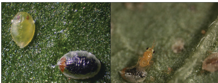
Figure 5. Bemisia tabaci nymph parasitized by parasitic wasp, Encarsia sophia (on left), parasitoid emerging (on right).

Several biological agents are available for managing B. tabaci including predators (the mite Amblyseius swirskii , or the insects Delphastus catalinae and lacewing larvae), parasitoids ( Eretmocerus eremicus , Encarsia spp.) or entomopathogenic fungi ( Beauveria bassiana , Cordyceps fumosorosea ). Before applying any biocontrol agents (BCA), it is important to check with commercial vendors of BCA for their compatibility with chemicals and environmental requirements such as temperature, humidity, and day length. BCAs may not control an existing high population of whiteflies before significant crop damage occurs, so early application of agents before high pest buildup is recommended. Use of generalist predators can provide control of B. tabaci along with other pests of ornamentals. In Florida, B. tabaci is effectively managed on ornamentals and vegetables grown in greenhouses with Encarsia sophia . In our recent greenhouse studies focused on integrated management of MED on salvia and mint crops, we observed the predatory mite A. swirskii and parasitic wasp E. eremicus to be very efficient in managing this pest, respectively. Consult with your local UF/IFAS Extension specialist about the suitable biocontrol agents available for a specific crop.