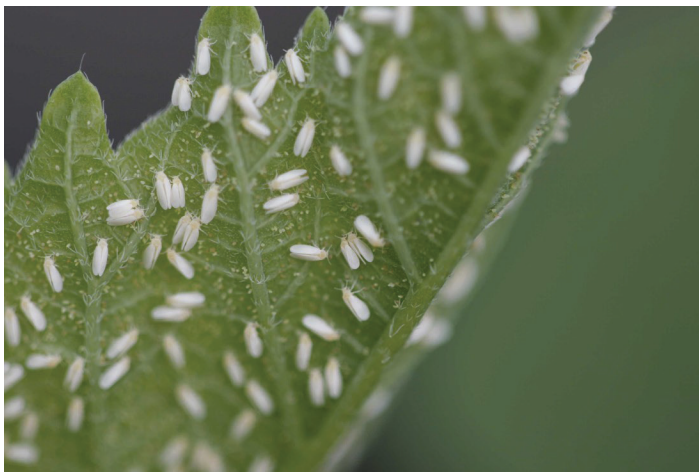
Figure 1. Whitefly, Bemisia tabaci Gennadius, eggs and adults.

This publication is intended to provide a management program for nursery and ornamental plant growers to aid in their efforts to minimize selection for insecticide resistance irrespective of whitefly biotype while helping to achieve top-quality plant materials.