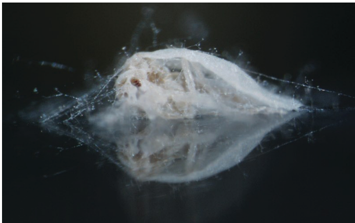
Figure 6. Whitefly adult infected by entomopathogenic fungi B. bassiana .