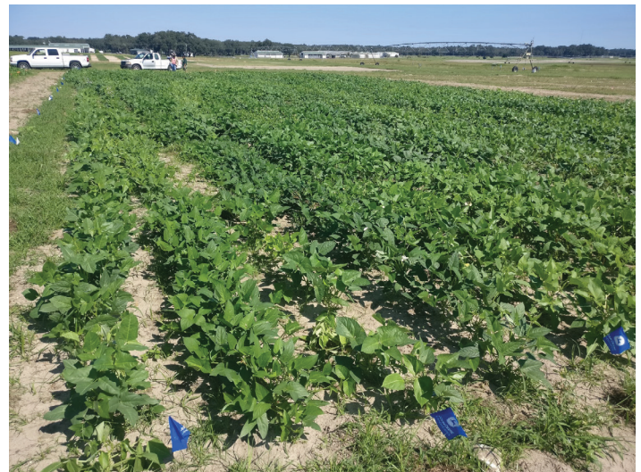
Figure 1. Cowpea breeding trial at the University of Florida.

Cowpea is a resilient crop critical for the nutrition and income of millions of families in the tropical and subtropical world. It has a rich history in the southeastern United States, where it has been grown for centuries. Cowpea is one of the most tolerant legumes to high temperature and drought, and it can be a significant contributor to sustainable cropping systems. Therefore, it is well-adapted to Florida's hot and humid climate as well as sandy soils.