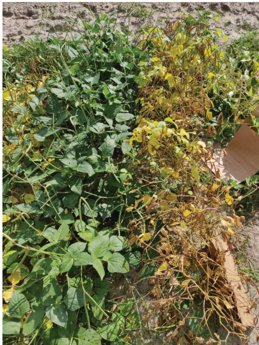
Figure 3. Differential cultivar performance for biotic stresses in Florida. Healthy cowpea cultivar (left) grown next to a pest- and disease-susceptible cultivar (right).