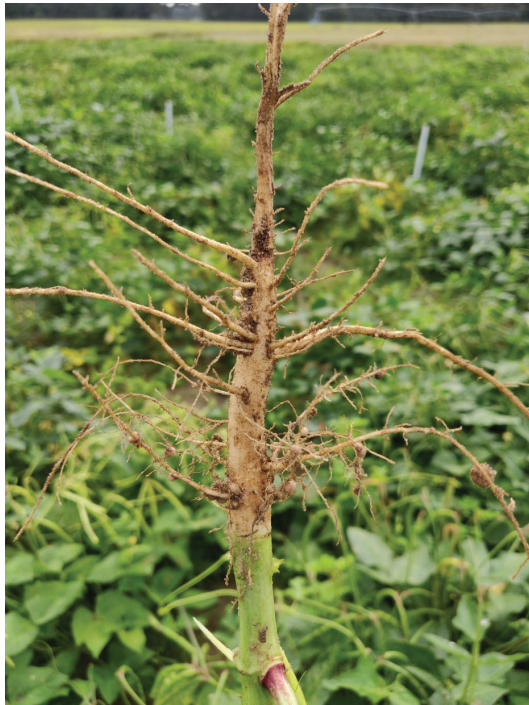
Figure 2. Cowpea root system showing large, round nodules that are fixing nitrogen.

as cover crops could result in severe root galling (Figure 4). When nematodes build up on cowpea or other cover crops, they can cause damage and yield loss to the next crop planted, which could be a valuable cash crop.