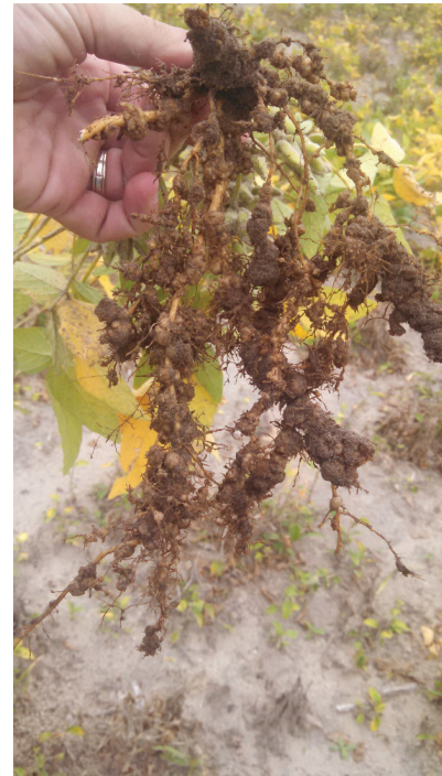
Figure 4. Severe root galling from root-knot nematode on soybean. Galls are irregularly shaped swellings of the root. This distinguishes them from nodules, which are regular, rounded, and easily detached from the root.