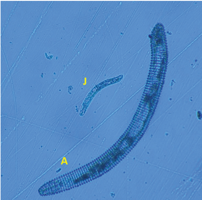
Figure 5. Adult female (A) and juvenile (J) Mesocriconema ornatum . Juvenile stages look similar to adult females, but they are smaller.