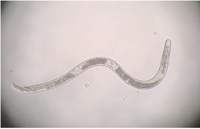
Figure 4. Male ring nematode Mesocriconema ornatum . Male ring nematodes exhibit sexual dimorphism, meaning the males and females look very different from each other. Male Mesocriconema spp. are slender and lack feeding apparatus and heavy annulations that are present in females.