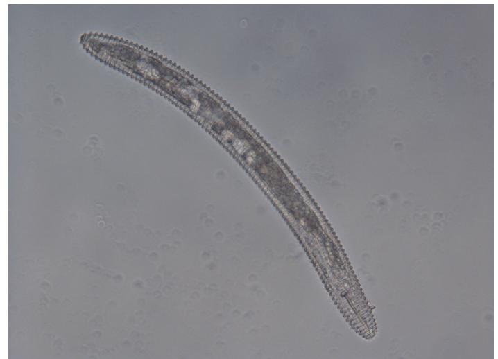
Figure 3. Female Mesocriconema ornatum . The body is cigar-shaped and heavily annulated.