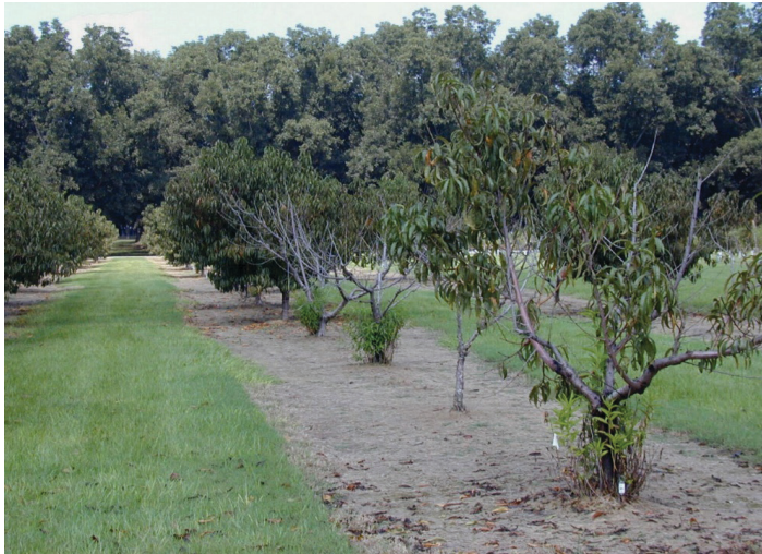
Figure 1. A peach tree showing symptoms of Peach Tree Short Life (PTSL) associated with ring nematode, Mesocriconema xenoplax .

retorse cuticular annulations. These annulations make the nematode's body look like it is made up of "rings" and, hence, the common name ring nematode. The body of Mesocriconema xenoplax and Mesocriconema ornatum is 'cigar-shaped'; adult females (Figure 3) are generally around 500 \mu\text{m} long and 50 \mu\text{m} wide and their vulva is located posterior, approximately 80-90 percent down the body. Males are rare for both species. When males (Figure 4) are present, they exhibit sexual dimorphism, greatly differing in appearance from the females, have no stylet and apparently do not feed. Juveniles of both species are smaller, and their body shape generally resembles the adult females (Figure 5). Mesocriconema xenoplax and Mesocriconema ornatum are very similar in appearance, have overlapping morphometrics, and are often confused for each other. There are subtle differences in the lip annules (Figure 2), projections in vulval annules, and tail annules (Figure 6), but even trained nematode taxonomists often have a hard time separating them morphologically. Therefore, the easiest way to speciate these ring nematodes is with DNA sequencing.