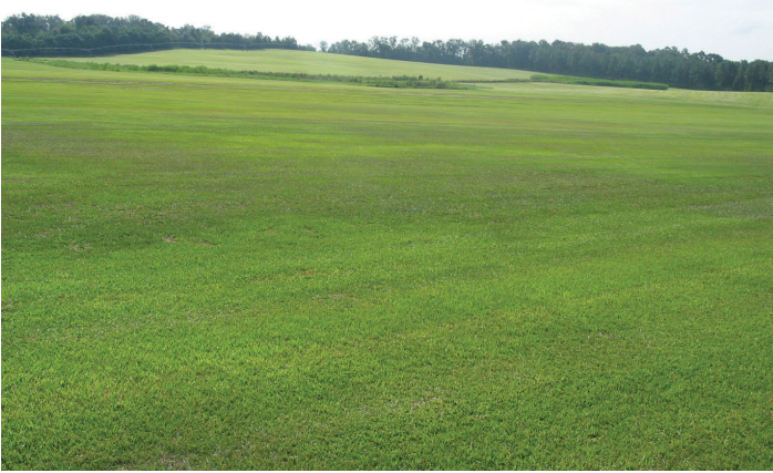
Figure 7. Aboveground symptoms of Mesocriconemas ornatum on centipede grass.