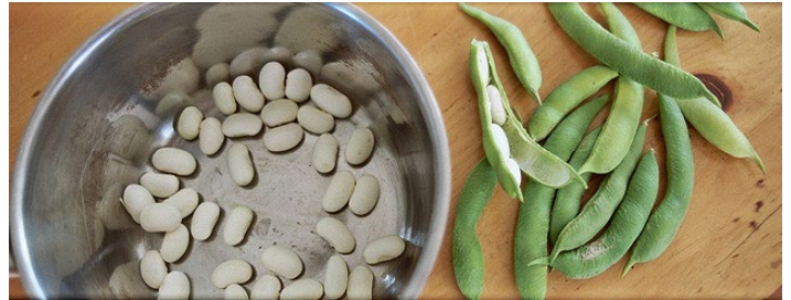
Figure 2. Cannellini

Beans, peas, and lentils may be available fresh, frozen, or, more commonly, dried or canned .