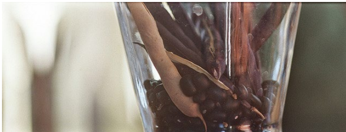
Figure 1. Black turtle

Beans, peas, and lentils are also called legumes or pulses . A wide variety of legumes is found all over the world, each with a unique color, shape, and flavor. Some commonly consumed beans, peas, and lentils are featured throughout this publication.