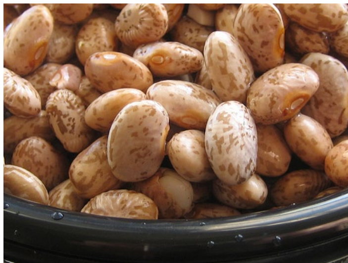
Figure 5. Pinto

When deciding what type of beans to buy, consider nutritional content. Most beans have similar base nutritional values, being high in protein and fiber. Table 1 lists