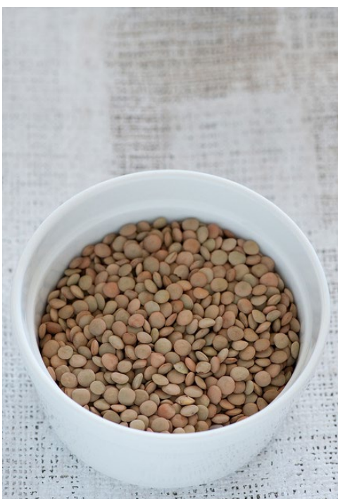
Figure 4. Brown Lentils Credits: Photo by Jules Clancy / StoneSoup, used here under Creative Commons license CC BY 2.0 . Source: http://flic.kr/p/8Cvxiw .