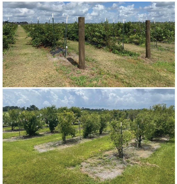
Figure 1. Blackberry orchard (top) and pomegranate orchard (bottom) at UF/IFAS GCREC in Wimauma.

arthropod pests found in blackberry and pomegranate orchards as a result, are discussed here.