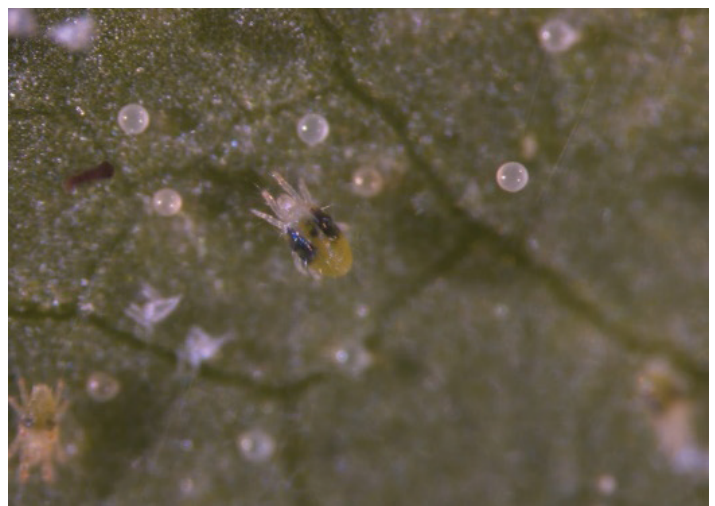
Figure 8. Twospotted spider mite and eggs.

The twospotted spider mite, Tetranychus urticae Koch (Acari: Tetranychidae), is a significant arthropod pest in multiple fruit crops. Adult twospotted spider mites range from 2–3 mm in length, have eight legs, and are tan or greenish with two dark spots, one on each side of the back (Figure 8). There are four developmental stages of the twospotted spider mite: egg, larva, two nymphal stages, and adult. Adult mites can overwinter on canes or in plant debris while waiting for warmer temperatures to significantly increase mite activity. Twospotted spider mites feed on the sap of leaves, causing chlorosis, which reduces plant vigor, leading to premature leaf drop. Webbing on the undersides of leaves is indicative of spider mite feeding. With high infestations, these pests can cause severe yield loss.