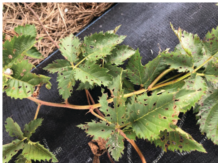
Figure 3. Flea beetle damage on blackberry.

Flea beetles are small, metallic blue-green beetles with great jumping skills. The flea beetle, Altica spp. (Coleoptera: Chrysomelidae), varies in size from 3–9 mm. Females lay their eggs in clutches of 1–15 on the upper and lower surfaces of leaves. Larvae emerge after 5–8 days, are dark brown, and have 10 body segments (Phillips 2019). This species has three larval stages. Pupation occurs in the soil. Adults emerge from the soil in the spring. Larvae and adults both have biting-chewing mouthparts that they use to feed on foliage (Figures 3 and 4). Flea beetles are found worldwide and can cause damage to economically important plants if they reach large numbers, but they are also excellent biological control agents for weed management.