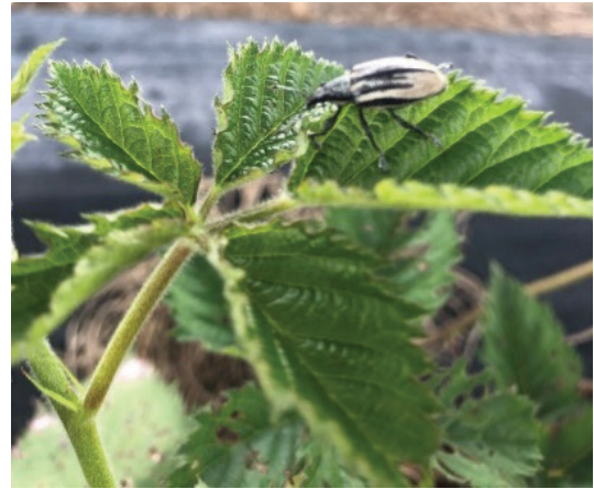
Figure 5. Citrus root weevil.

metalized reflective mulch, can help prevent the larvae from entering the soil and the adults from emerging.