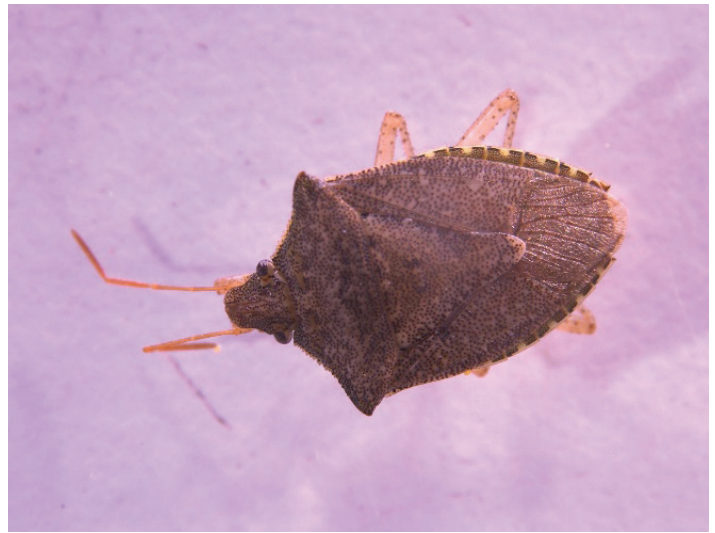
Figure 7. Dusky stink bug.

Maintaining a natural predatory and parasitoid population is ideal to help control stink bug populations. Predators such as big-eyed bugs, grasshoppers, and spiders feed on stink bugs (Morrison 2016).