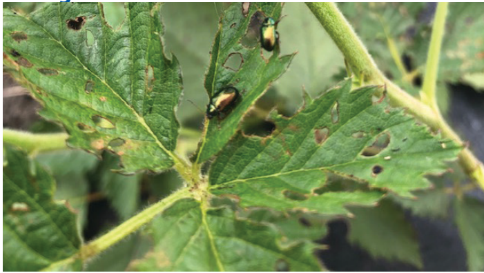
Figure 4. Flea beetles actively feeding on blackberry bush.

Parasitoids are also known to attack flea beetles. Hymenoptera from the family Braconidae and dipterans from the family Tachinidae are natural predators of flea beetles in Florida (Phillips 2019). Maintaining a healthy predator population will help keep flea beetles from establishing in large numbers.