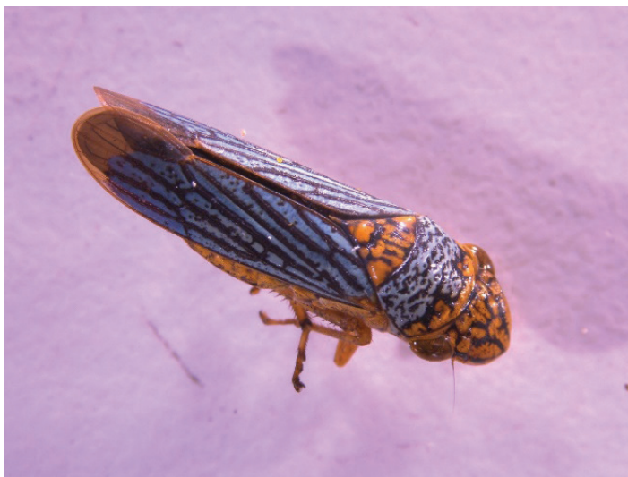
Figure 2. Black-winged sharpshooter.

Sharpshooters are invasive leafhoppers in Florida. They have piercing-sucking mouthparts, which they use to feed on the xylem and phloem tissues of host plants. The black-winged sharpshooter, Oncometopia nigricans Walker (Hemiptera: Cicadellidae), is 8–9 mm long and yellow or orange with pronotum and bluish to bluish-gray forewings (Figure 2). Wings have black markings along veins. Sharpshooters go through incomplete metamorphosis with five nymphal instars and an adult stage. Female sharpshooters lay their eggs in masses under the epidermis of leaves. The nymphs are wingless and leap from leaf to leaf in search of food. Sharpshooters feed on a wide variety of plants and can cause physical damage to plants in large enough numbers, which most often occurs in spring and summer. However, the primary damage from sharpshooters comes from vectoring infectious pathogens that cause economically important diseases in plants. There is currently no documented evidence of this pest vectoring diseases of blackberries and pomegranates in Florida.