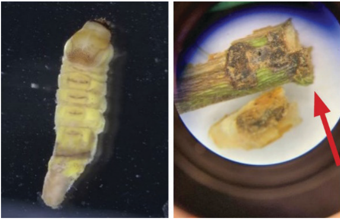
Figure 6. Raspberry cane borer larvae (left), and entry point on blackberry cane and frass from larva of raspberry cane borer (right).