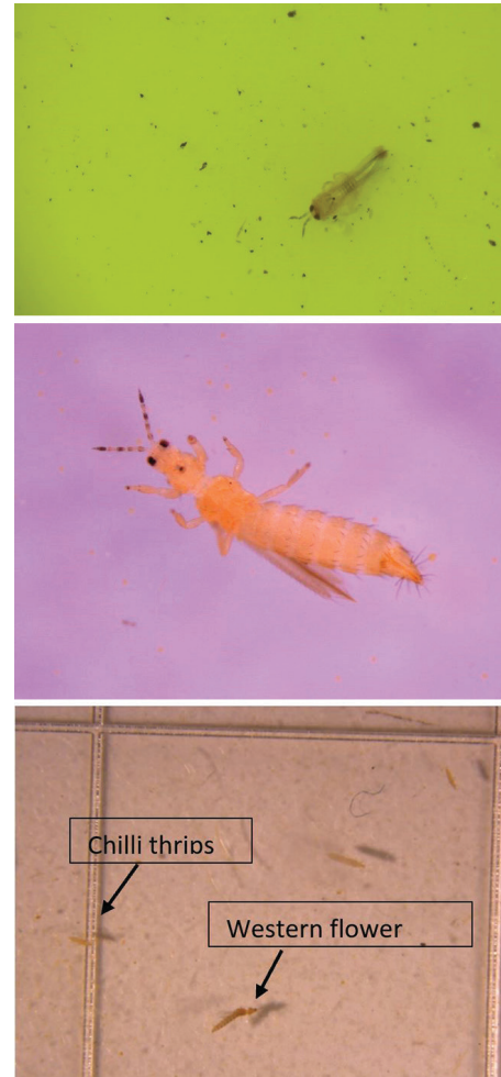
Figure 9. Chilli thrips, Scirtothrips dorsalis Hood on a yellow sticky trap used for scouting (top). Western flower thrips, Frankliniella occidentalis (Pergande) (middle). Chilli thrips, Scirtothrips dorsalis Hood and western flower thrips, Frankliniella occidentalis (Pergande) on gridded petri dish for size difference comparison (bottom).

Thrips develop resistance to most insecticides rapidly. Therefore, rotating modes of action is very important. See Table 1 for registered products for Florida blackberry.