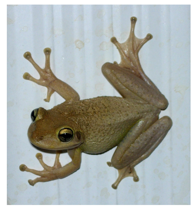
Figure 2. Florida's Cuban treefrog