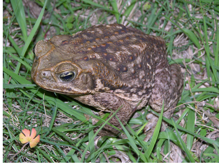
Figure 3. Florida's Cane toad (aka "Bufo toad")