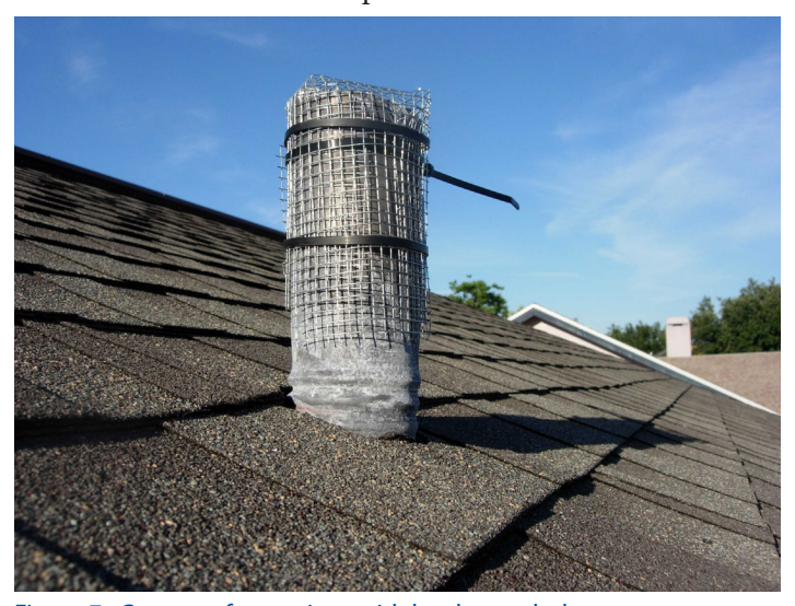
Figure 7. Cover roof vent pipes with hardware cloth to prevent entry into buildings by Cuban treefrogs.

nuisance wildlife, listed according to county of operation (https://public.myfwc.com/HGM/NWT/NWTSearch. aspx). Note that hiring a professional is expensive.