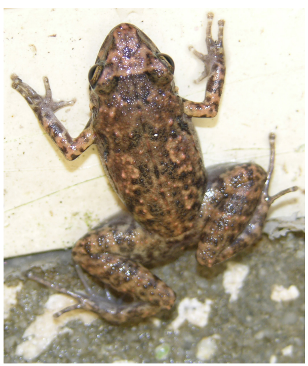
Figure 1. Florida's Greenhouse frog