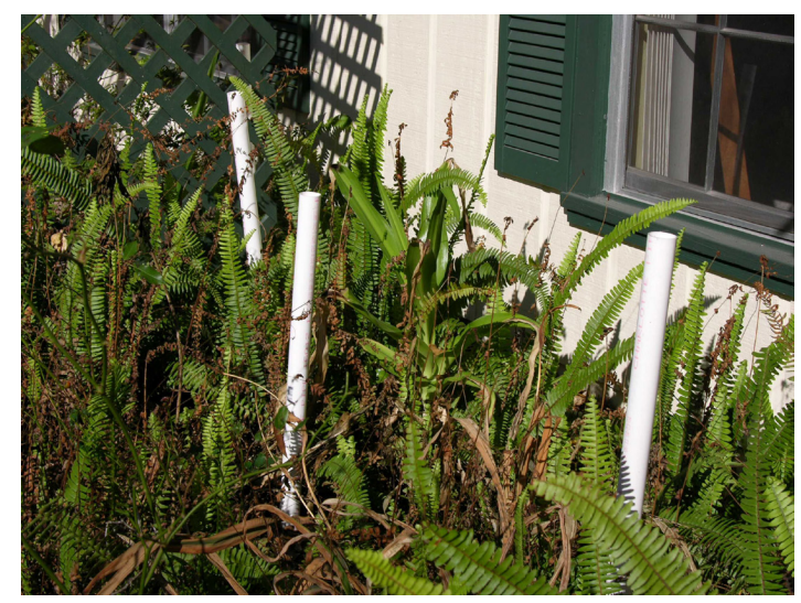
Figure 5. You can erect PVC pipes in your yard to capture Cuban treefrogs.