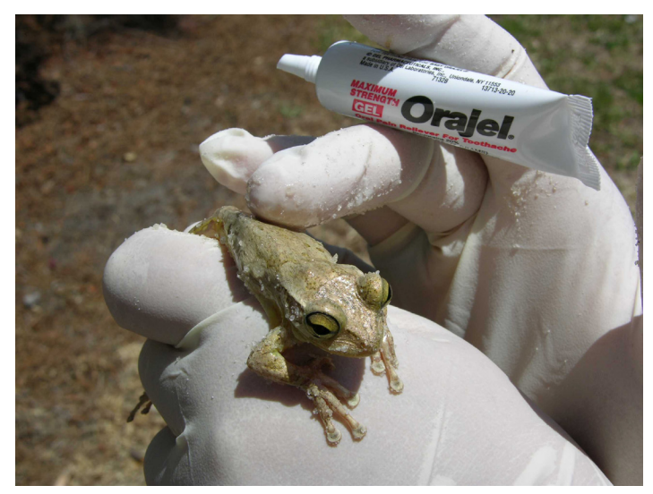
Figure 6. Cane toads and Cuban treefrogs can be euthanized humanely after capture by applying a benzocaine- or lidocaine-based ointment or spray to the frog's back or belly, securing the frog in a plastic bag, and placing the bag in a freezer overnight.