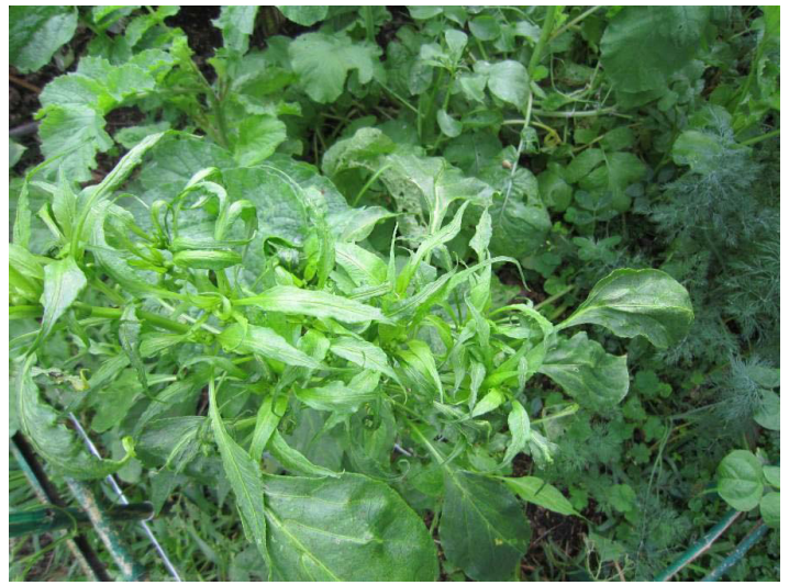
Figure 9. Jalapeño pepper plants damaged by broad mites.

Broad mite: The broad mite, Polyphagotarsonemus latus (Banks), has eight legs and is almost microscopic (less than 0.2 millimeter long) and difficult to see with the naked eyes. It usually occurs on the underside of young, emergent leaves. In peppers, broad mites feed on all above-ground plant tissues and cause leaves to become thick and narrow, which give them a "strappy" appearance (Figure 9). Heavy feeding may lead to flower abortion and stunted plants. High temperatures and humidity often increase population growth rates, though in Miami-Dade County broad mite damage to pepper plants commonly occurs during winter and spring.