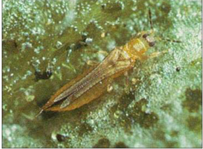
Figure 12. Melon thrips, Thrips palmi Karny, adult.

field, and maintaining a host-free period to disrupt the thrips life cycle.