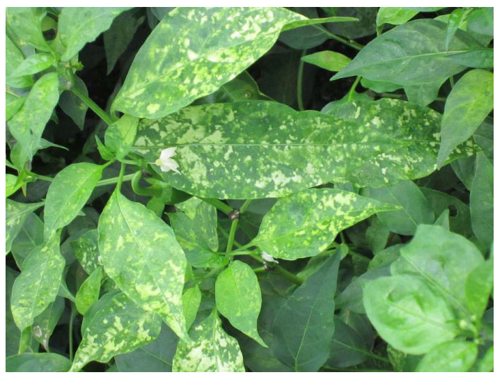
Figure 5. Cucumber mosaic virus on Jalapeño pepper.

Cucumber mosaic virus: The symptoms of Cucumber mosaic virus (CMV) vary considerably depending on the viral strain, but most plants develop narrow leaves in addition to stunting, yellowing, and whitish spots on the leaves (Figure 5). More than 80 species of aphids are capable of transmitting the virus. Insecticides registered for pepper plants, such as Admire Pro (imidacloprid), Beleaf 50 SG (flonicamid), and Movento (spirotetramat), are used to control aphids, which vector CMV. Rotation with crops other than susceptible hosts (such as tomatoes, lettuce, and cucurbits) can also help control CMV.