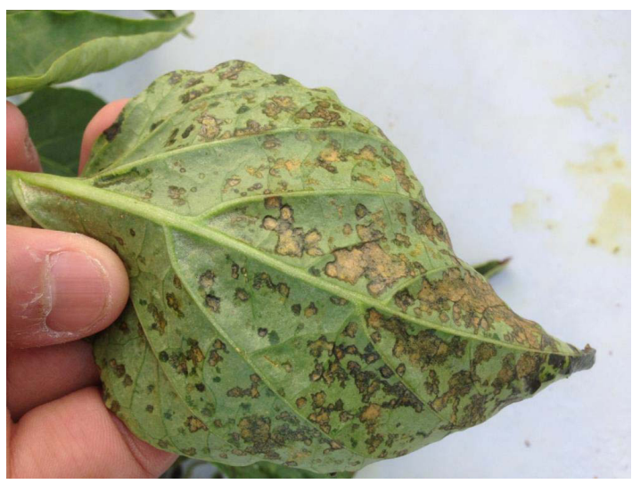
Figure 1. Bacterial spot on pepper leaves.

Actigard (acibenzolar-S-methyl), a plant defense activator, and copper-based chemicals such as copper hydroxide and copper sulfate mixed with mancozeb/maneb can be applied to control the disease.