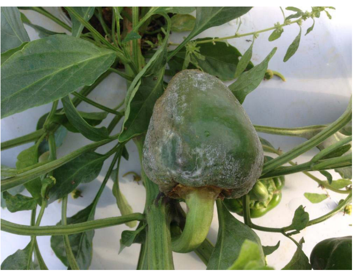
Figure 4. Pepper fruit infected with P. capsici .

Phytophthora capsici also causes other symptoms, such as spots, blight, and fruit rot (Figure 4). The disease often spreads from rain splashing infested soil onto plants. Hence the stems, leaves, and fruit often become infected when wet conditions persist for several days.