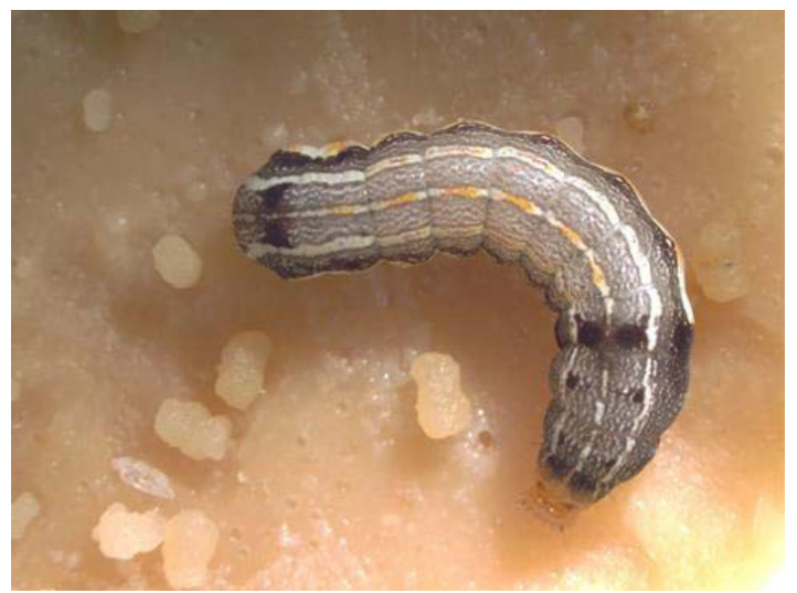
Figure 11. Beet armyworm (BAW), Spodoptera exigua (Hübner), larva.

pepper plants and causes serious economic damage even at low population levels. A single larva feeding under the calyx of a pepper fruit can render it unmarketable.