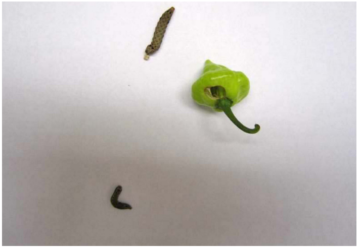
Figure 10. Habanro pepper fruit damaged by armyworms.

Thrips: In south Florida Thrips palmi Karny has been reported as a devastating pest of bean, squash, cucumber, eggplant, pepper, potato, and okra (Seal and Baranowski 1992). Thrips palmi is a polyphagous and economically very important pest (Kirk 1997). The wide host range of T. palmi includes at least 50 plant species (Wang and Chu 1986) and provides abundant food sources allowing it to survive throughout the year. Regardless of host plant in south Florida, T. palmi populations are abundant from January to March and decrease after May, possibly because of the rainy season lasting from mid-May to mid-September (Seal 1997). Thrips palmi attacks all above-ground parts of