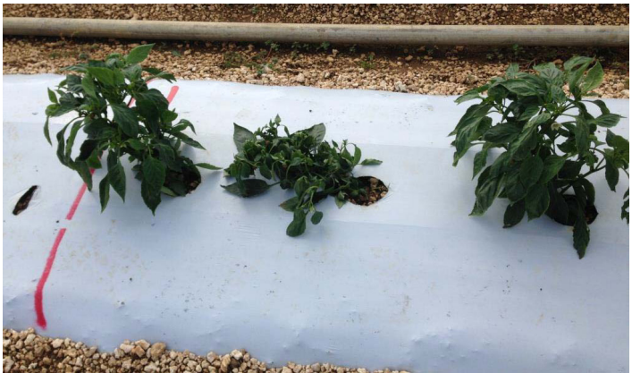
Figure 3. Wilting pepper plant infected with P. capsici .

certain rows, it often indicates excessive irrigation and the spread of infective spores by water.