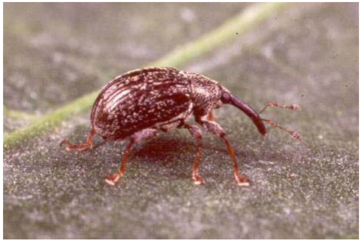
Figure 6. Adult pepper weevil, Anthomus eugenii Cano.

To attack the plant, a female adult weevil (Figure 6) first punctures the flower buds or young fruit of peppers with her mouthparts, lays eggs, and then seals the puncture containing the eggs with a light brown fluid, which hardens and darkens. The larval stage of PW, commonly known as a grub (Figure 7), is white or gray with a yellowish brown head. PW larvae feed on pepper and other plants in the Solanaceae family, such as the common black nightshade weed, Solanum americanum , and the tomatillo, Physalis philadelphica . All varieties of pepper are susceptible to PW attack, whereas tomatillos are only moderately susceptible.