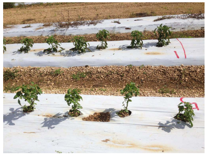
Figure 2. Defoliation of pepper plants because of bacterial spot.

Phytophthora blight: Phytophthora blight, caused by a soil-borne, fungus-like oomycete, Phytophthora capsici , can severely affect the growth of pepper plants by causing them to wilt and eventually die (Figure 3). Similar to fungal pathogens, Phytophthora causes disease when the soil becomes excessively wet, either from over-irrigation or from heavy rain. Therefore Phytophthora disease outbreaks usually occur in heavy soil or in low spots where water tends to accumulate for long periods. Diseased plants are commonly clustered within fields, such as in specific rows or at the end of the field, while the remainder of the planting often appears healthy. When the disease occurs in