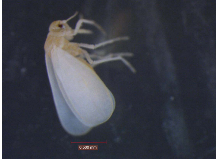
Figure 8. Adult silverleaf whitefly, Bemisiz argentifolii (Bellows and Perring).