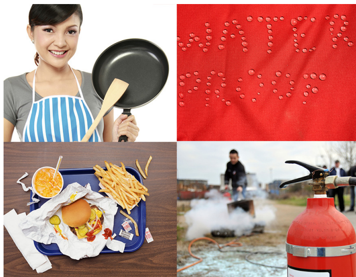
Figure 2. Examples of common sources of perfluoroalkyl substances in the environment. Clockwise from top left: (1) non-stick pan, (2) waterproof textile, (3) fire-fighting foam, (4) food wrap papers.

use PFASs because of their excellent surfactant properties such as reducing friction and improving the efficiency of engines.