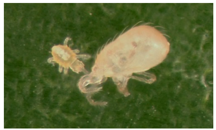
Figure 9. Even larval Hemicheyletia wellsina (De Leon) (left) can attack and kill a much larger adult female of Metaseiulus occidentalis (Nesbitt) (right).