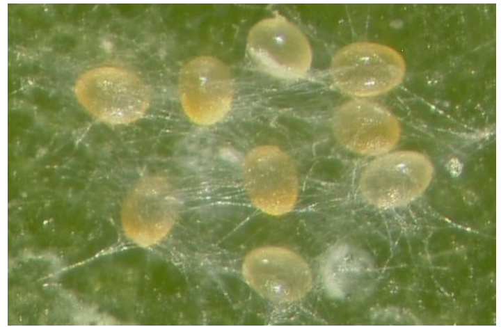
Figure 4. A clutch of Hemicheyletia wellsina (De Leon) eggs covered with silk produced by the mother.

The average lifespan of Hemicheyletia wellsina from hatching until death is approximately 30 days, with individuals living as few as 16 days and as long as 47 days at 25°C with