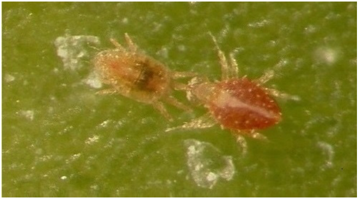
Figure 5. Hemicheyletia wellsina (De Leon) adult (right) feeding on Tenuipalpus pacificus Baker, or the Phalaenopsis mite (left), a serious pest of Phalaenopsis orchids.

( Figure 8 ). However, without access to food, a newly emerged adult female Hemicheyletia wellsina can live for approximately 10 days without feeding (Ray and Hoy 2014a). Individuals do not require many prey to survive, with adult Hemicheyletia wellsina females feeding on an average of 1.5 adult spider mites per day, and an average of 27 adult spider mites throughout their lifetime.