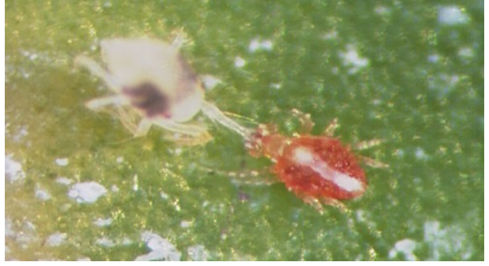
Figure 6. Adult Hemicheyletia wellsina (De Leon) (right) feeding on an adult female of the two-spotted spider mite Tetranychus urticae (Koch) (left) by grasping the front leg of the spider mite.