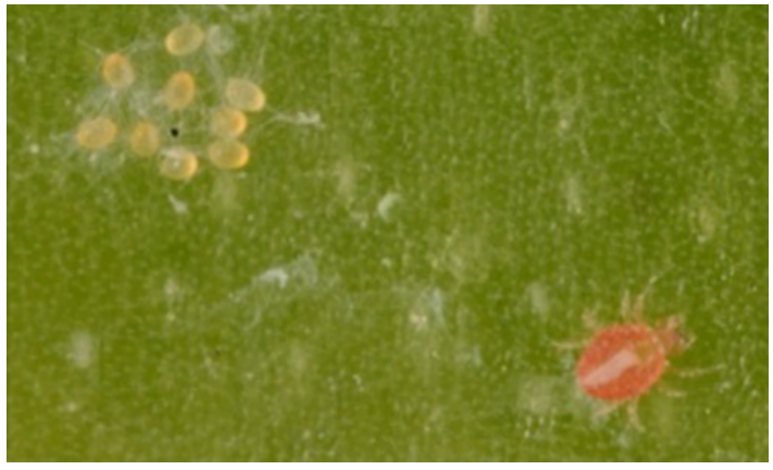
Figure 1. Adult female Hemicheyletia wellsina (De Leon) in the lower right corner of the photo near a clutch of her eggs in the upper left. The eggs are covered with silk produced by the female.

Hemicheyletia wellsina (De Leon) ( Figure 1 ) is a predatory mite in the family Cheyletidae. The life history of species in this family is very diverse. About 75% of cheyletid mites are predators of other arthropods and the rest are parasitic on birds and mammals (Bochkov and O'Connor 2004, Krantz and Walter 2009). Hemicheyletia wellsina was recently discovered in an unsprayed greenhouse at the University of Florida, Gainesville, living on Phalaenopsis and Dendro bium orchids, and assumed to be feeding on orchid pests such as spider mites, tenuipalpid mites, and mealybugs that were present on the orchids. Because there was no published information on the biology of effectiveness of