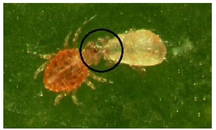
Figure 8. Adult Hemicheyletia wellsina (De Leon) (left) feeding on an adult female of Metaseiulus occidentalis (Nesbitt) (right), a larger predatory species. The circle indicates the Hemicheyletia wellsina has grasped the palp of this larger phytoseiid predator.