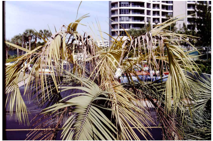
Figure 4. Manganese deficiency in pindo palm. Note the necrosis of leaflets on the basal part of the youngest leaves.

To prevent or correct nutrient deficiencies in pindo palms, 3 (4 in south Florida) applications per year of a controlled release 8N-2P 2 O 5 -12K 2 O-4-Mg plus micronutrients fertilizer are recommended. For more information about fertilizing landscape palms in Florida see Fertilization of