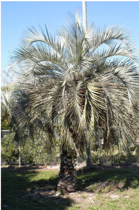
Figure 1. A 35-year-old pindo palm ( Butia odorata ).

The pindo or jelly palm was formerly known by the scientific name Butia capitata . However, recent research has shown that the correct name for this palm should be B. odorata . This small, single-stemmed, feather-leaved palm is widely grown in warmer parts of the US due to its unusual cold tolerance. It is considered hardy down to about 10°F or USDA zone 8A (see http://planthardiness.ars.usda.gov/PHZMWeb/ ). While they survive in south Florida, pindo palms grow much better in cooler, less humid climates. They are considered to be intolerant of salt spray.