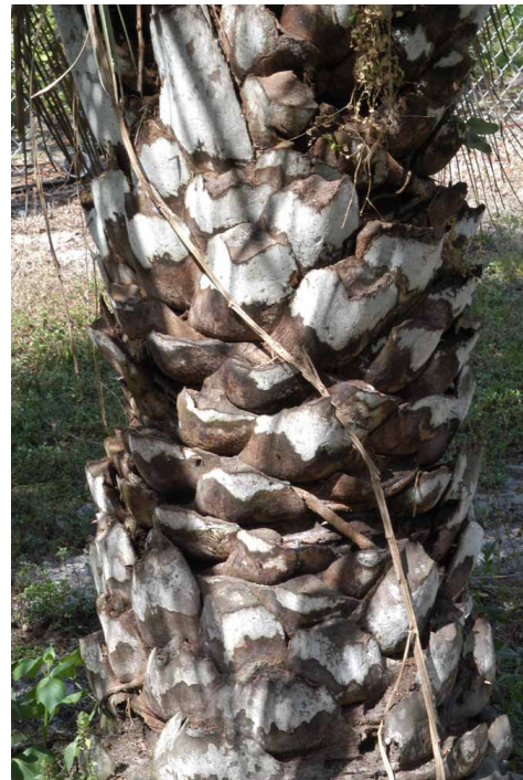
Figure 2. Trunk of pindo palm showing persistent leaf bases.

The palm is slow-growing, eventually reaching 15–20 feet, making it suitable for planting under power lines (Figure 1). Its gray-green recurved leaves are about 4–6 feet long and have leaflets attached to the petioles in a deep V shape. The petioles have spines along their margins. The leaf bases are strongly persistent and give the trunk a distinctive knobby appearance (Figure 2). The 3–4-foot-long flower stalks eventually produce edible 1-inch-diameter yellow to orange fruits. Pindo palm seeds are notoriously slow and difficult to germinate, but research has shown that simply cracking