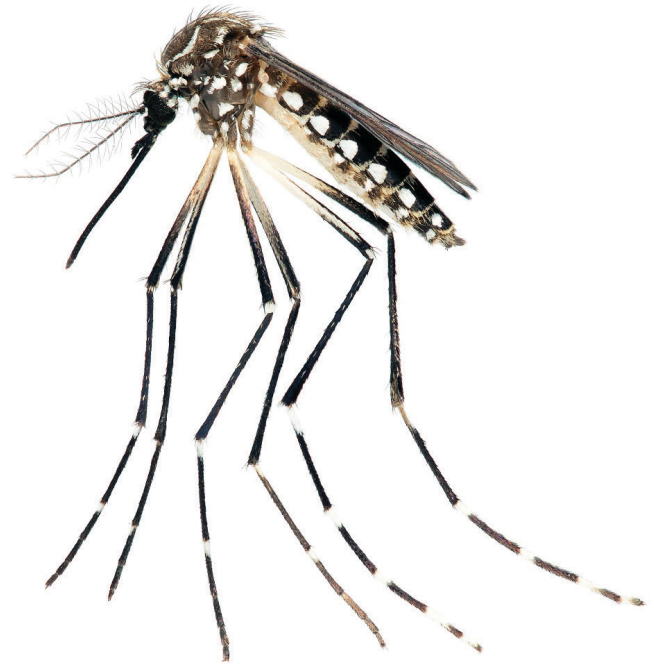
Figure 4. Aedes aegypti mosquito, a potential vector of Mayaro virus, collected in Indian River County, Florida.

mosquito vectors that feed from them. Others are “reservoir hosts.” These hosts are susceptible to infection, may or may not experience disease, and allow sufficiently high levels of virus replication to infect any subsequent competent mosquito vectors.