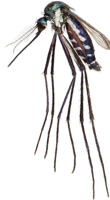
Figure 2. Adult female Haemagogus janthinomys , an expected important vector of Mayaro virus, collected on Ilha Grande, Rio de Janeiro, Brazil.

where the canopy has been disturbed by deforestation. Female Haemagogus janthinomys feed on a broad range of vertebrate hosts, especially birds and mammals, including humans, non-human primates, and rodents (Alencar et al. 2005). In addition to MAYV, this mosquito is an important vector for yellow fever virus, and Ilheus virus has been isolated from specimens collected in Panama.