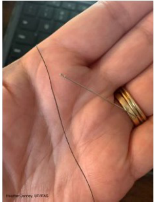
Figure 3. Drape the thread across your palm.