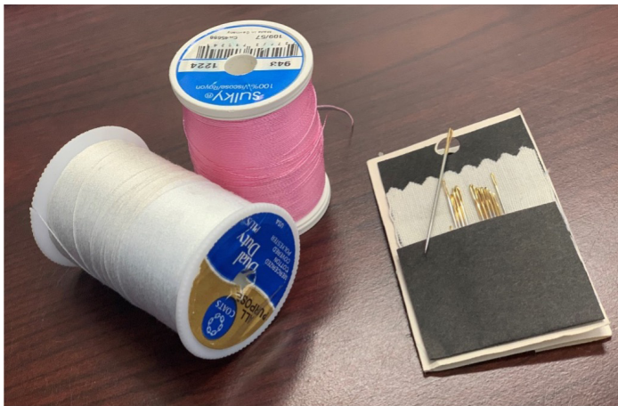
Figure 1. All you need is thread and a needle.

The old-fashioned way is the easiest and can simplify things so much. You will need a spool of thread and a needle. Cut a piece of thread large enough to loop it through the needle