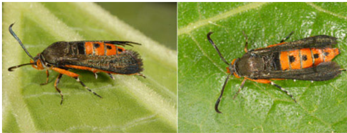
Figure 1. Adult squash vine borer, Melittia cucurbitae (Harris).

Squash vine borer, Melittia cucurbitae (Harris), is a diurnal (active during the day) moth species (Fig. 1). The larvae complete their growth and development on wild and domesticated species of the genus Cucurbita . This insect was once considered a nuisance to commercial growers and a problem to home growers of cucurbits. However, with the expansion of cucurbit production in the United States (U.S.) over the last decade, the squash vine borer has become a pest of economic importance (Brust 2010).