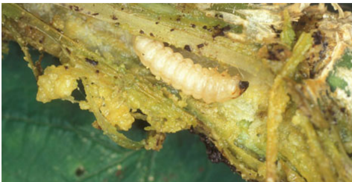
Figure 4. Larva of the squash vine borer, Melittia cucurbitae (Harris).

The larvae are white, with a darkened head capsule, three pairs of thoracic legs, and five pairs of prolegs (peg-like legs on the abdomen of a larva). Newly emerged larvae are 1.5 to 2 mm long, tapered on the posterior end, and covered with numerous large hairs. As the larva matures, it develops a dark thoracic shield, loses its tapered shape and hairy appearance, and grows to a length of approximately 25 mm (Fig. 4, Bauernfeind and Nechols 2005, Capinera 2008). Late instar larvae burrow into the soil before pupation.