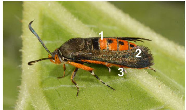
Figure 5. Adult squash vine borer, Melittia cucurbitae (Harris). (1) Abdomen covered by orange to reddish hairs and punctuated with black dots dorsally, (2) Front wings covered by scales that give them a metallic green to black sheen, (3) Hind legs covered with long black hairs inside and orange hairs outside.

A single larva feeding on a pumpkin plant can reduce yield by up to 4%, three to four larva per plant are capable of causing a yield loss of more than 20%. Six or more larvae per plant are enough to severely damage or kill a plant (Brust 2010). In addition, the larval feeding predisposes the host plant to infection by opportunistic plant pathogens.