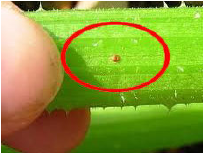
Figure 3. In the center of the red circle is one egg of the squash vine borer, Melittia cucurbitae (Harris).

The eggs of the squash vine borer are laid singly on the lower part of the main stem of the host plant, as well as on the leaf stalks, leaves, and fruit buds. Some eggs are laid in the cracks in the soil near the base of the plant (Canhilar et al. 2006). Eggs are dark to reddish brown, ovoid but slightly flattened, and small; they measure approximately 1 mm in length and 0.85 mm in width (Fig. 3, Capinera 2008, Bauernfeind and Nechols 2005).