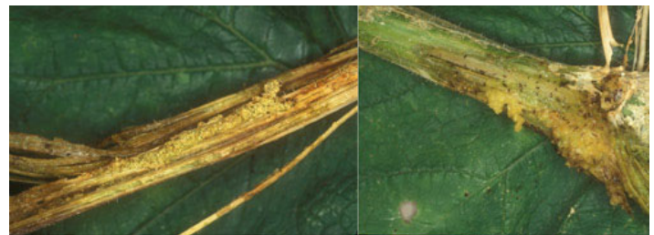
Figure 6. Squash vine borer damage, Melittia cucurbitae (Harris), on squash.