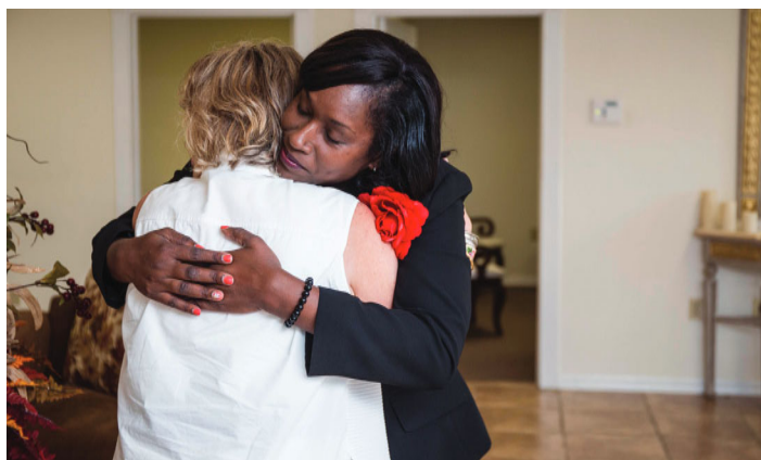
Figure 2. During this vulnerable time, compassionate care, respect for personal preferences, and good communication are paramount.

Most older adults want to discuss and influence decisions about their care (APA, n.d.). They may not know what their options are or have information in order to plan in advance. This series discusses the major topics you need to address, supplies information you need, and gives ideas to begin conversations with family and/or friends and health care providers in advance. With information about available options and communication with loved ones and health care providers, individuals can lay the groundwork for preferred methods of care when the time comes and rest assured that their preferences will be respected (APA, n.d.).