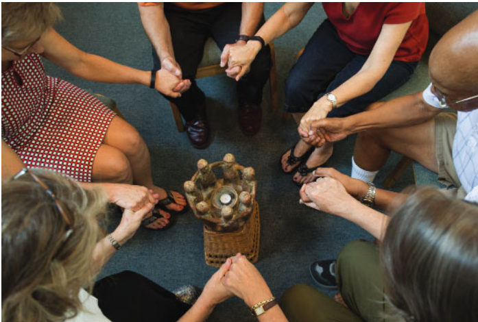
Figure 1. A support system helps people process end-of-life issues.

“For all but our most recent history, dying was typically a brief process. Whether the cause was childhood infection, difficult childbirth, heart attack, or pneumonia, the interval between recognizing that you had a life-threatening ailment and death was often just a matter of days or weeks.” —Atul Gawande in “Letting Go” (Gawande, 2010)