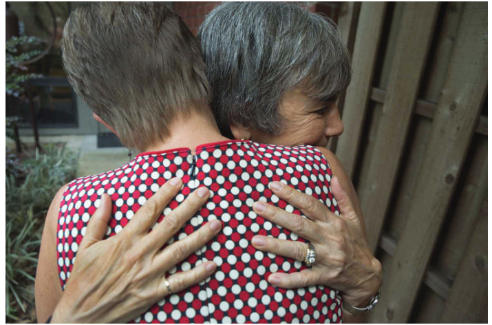
Figure 5. Through communication and proper preparation, individuals can positively affect their end-of-life experience.

This series goes along with an educational program by the same name. To learn more about The Art of Goodbye: End of Life Education and find out how you can attend, contact your local UF/IFAS Extension office.