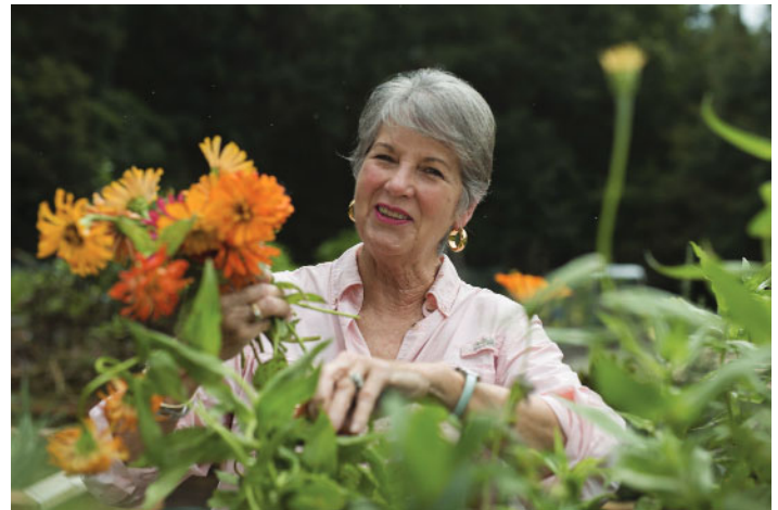
Figure 3. Adults now live longer thanks to public health strategies and improvements in both medical care and personal lifestyle choices.

The dramatic increase in life expectancy in the 20 th century was the result of major improvements in human health (US Department of Health & Human Services, 2015). In the US, many more people are living into their eighties, nineties, and even hundreds (US Department of Health & Human Services, 2013). Older adults currently comprise almost 13% of the US population. By 2030, that number is projected to increase to 20%, or one-fifth of the population (72 million). The fastest growing segment of the aging population consists of those 85 years and older (US Department of Health & Human Services, 2013).