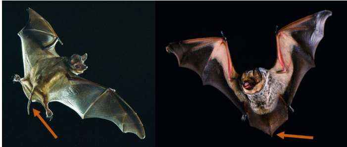
Figure 3. Free-tailed bats (those in the family Molossidae) have long tails that extend >1 inch beyond their tail membrane, like the bat on the left. In comparison, other bats have short, stubby tails, like the bat on the right (not a free-tailed bat).

Brazilian free-tailed bats emerge from their roosts shortly before sunset to forage on insects at high altitudes. They are important economically because they consume large quantities of insect pests. They feed on a variety of moths, beetles, and bugs that afflict common agricultural crops such as corn, cotton, soybeans, and pecans.