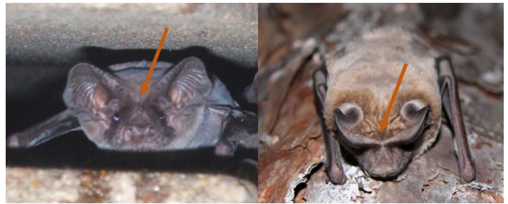
Figure 4. The ears of Brazilian free-tailed bats are not joined at the base (left), whereas those of the Florida bonneted bat are joined (right).