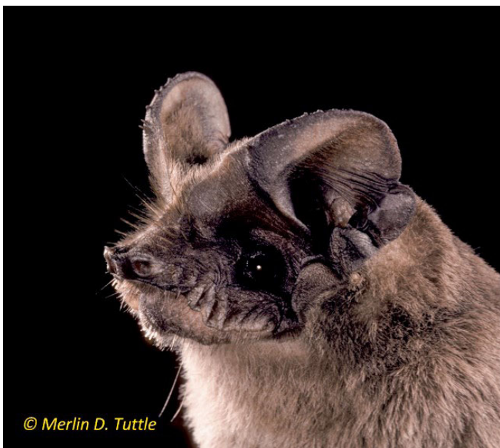
Figure 1. Brazilian free-tailed bat ( Tadarida brasiliensis).