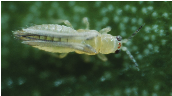
Figure 2. Chilli thrips, Scirtothrips dorsalis (Hood) adult.