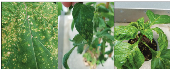
Figure 3. Tomato chlorotic spot virus -affected jimsonweed, tomato, and pepper leaves.

The kinds of damage thrips cause differ by species, but they can affect all the above-ground surfaces of their plant hosts, including leaves, fruits, and plant shoots. Feeding by commonly occurring thrips may produce one or more of the following symptoms: i) discoloring (silvering, darkening) of the leaf surface; stippled leaves and fruits; scarred petals, ii) linear thickenings of the leaf lamina; curled and distorted leaves/terminals, iii) brown frass markings on the leaves and fruits; iv) grey to black markings on fruits, often forming a conspicuous ring of scarred tissue around the apex; v) distorted or scabby fruits; vi) early senescence of leaves; and vii) stunted growth of the host.