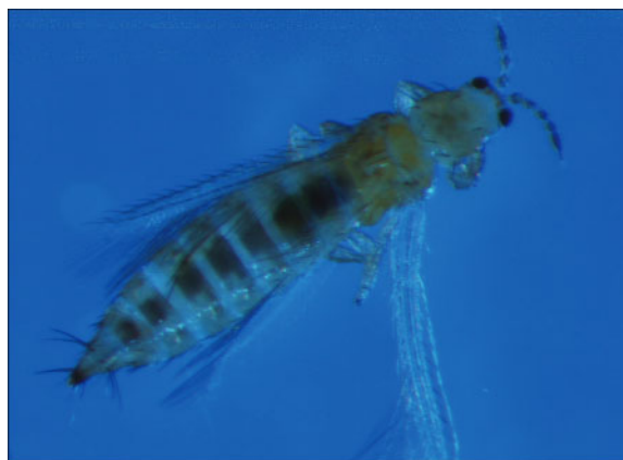
Figure 1. Western flower thrips, Frankliniella occidentalis (Pergande) adult.

virus (TSWV) was recently associated with transmission of Groundnut ringspot virus (GRSV) and Tomato chlorotic spot virus (TCSV) in Florida. Chilli thrips is also known to transmit Peanut bud necrosis virus (GBNV), Groundnut yellow spot virus (GYSV), and Groundnut chlorotic fan-spot virus (GCFSV) in different parts of the world (Reitz et al. 2011; Riley et al. 2011); however in the United States, no reports of chilli thrips-mediated disease transmission have surfaced yet. Considering recent reports of chilli thrips invasion in California rose production, it is extremely important that growers take appropriate measures to minimize economic damage. More information on these thrips species and their damage potentials can be found at http://edis.ifas.ufl.edu/IN1089 and http://edis.ifas.ufl.edu/IN833 .