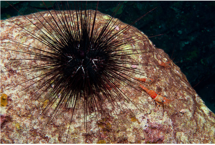
Figure 7. A long-spined sea urchin. These animals are algae grazers on Caribbean reefs and should be left alone to do their important work.

to avoid run-ins with coral. Contact your local dive shop to learn more.