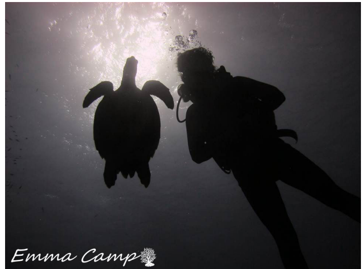
Figure 8. A diver observes a sea turtle in its natural habitat. Dive responsibly by maintaining neutral buoyancy and clasping your hands to avoid touching the reef.

Mooring bouys are commonly installed to allow boaters to secure their vessels at popular dive and snorkel locations on Florida's coral reefs. They are free to use in the Florida