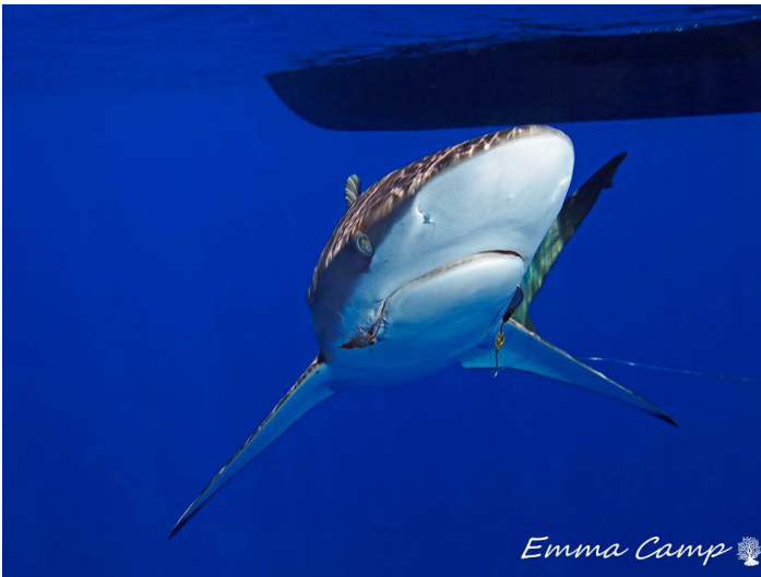
Figure 5. A silky shark off the coast of Florida with a hook caught in its mouth. Sharks are top predators that help keep ocean ecosystems healthy.