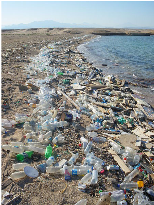
Figure 4. Garbage, mostly plastic bottles, accumulated on a beach. Tides can wash these items back into the ocean, where they can harm corals and other marine life. Participating in a beach cleanup can reduce this risk while making local beaches more beautiful.

Most people know that sea turtles, birds, and marine mammals are often harmed when they get trapped in ocean garbage. Just like other marine animals, corals get injured when they are tangled up in trash! Preventing the loss of fishing gear in the first place is cheaper, easier, and more effective than trying to clean it up after it is lost, so keep a close eye on your depth when fishing to avoid hooking coral. Divers and snorkelers can enjoy the reef while helping to protect it by participating in a reef clean up. Many dive shops organize reef clean up trips. Find out more at http://www.dep.state.fl.us/coastal/programs/coral/debris1.htm or call your local dive shop.