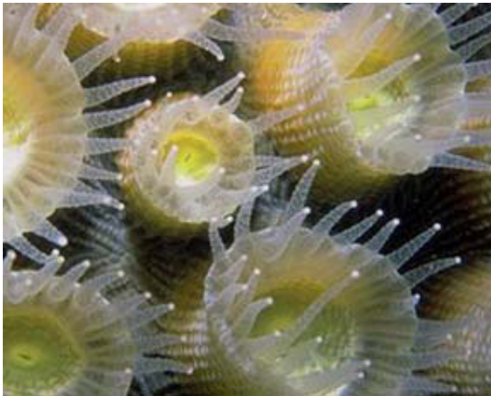
Figure 1. A close-up photo of a coral colony, showing several individual coral animals. Jellyfish-like tentacles extend from each animal's body.

Coral reefs are one of the most diverse ecosystems on the planet. Corals are small animals related to jellyfish (Figure 1). Large groups of these animals live together and form huge interconnected colonies (Figure 2). Many corals have a special relationship with a type of single-celled algae. The algae live inside the coral's body and produce most of their host's food through photosynthesis. Coral reefs are often found in shallow, tropical seas where these algae have enough sunlight to make food. The algae also give the coral its color—a healthy coral is typically yellow to brown (Figures 1 and 2). Using energy from the algae, some corals