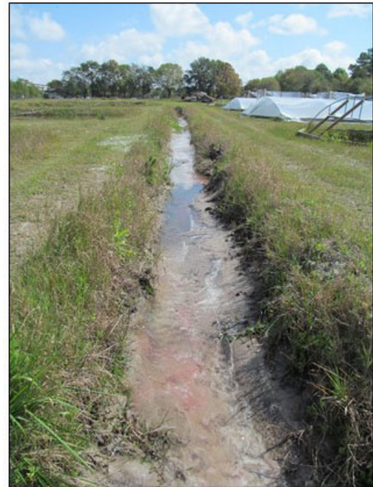
Figure 3. Vegetated interior ditch showing the early stages of sediment accumulation.

ditch berms along the property boundary is important for providing separation between the facility and the broader environment. Eliminating scour holes and uneven ditch slopes is key, since, as discussed previously, scour holes and uneven slopes will allow water to pool and provide habitat for non-native species. Vegetation removal allows FDACS inspectors to view water control structures and the amount of sediments within ditches. Ultimately, operators need to weigh the benefits of increased residence time versus periodic drying, which will prevent the establishment of non-native species.