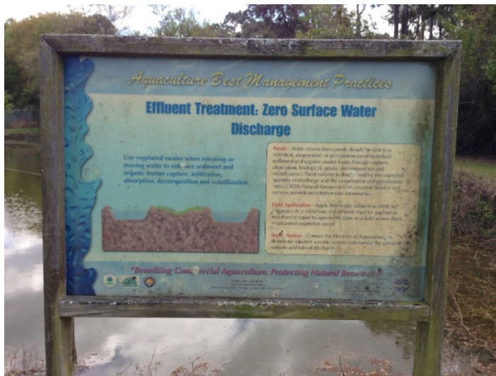
Figure 4. Example of a Best Management Practices sign posted on an aquaculture facility to remind and inform employees to follow the BMPs. Effective signs can be much more simple than this example, as long as they serve to remind employees of their responsibilities.

employee issues discussed above, as well as potential problems with the structural barriers discussed in Part 3 (Tuckett et al. 2016b). Inspection of effluents on-site and also adjacent off-site ditches and streams for non-native species will reveal the actual effectiveness of both the operational and structural strategies. The establishment and posting of accurate maintenance and inspection logs will allow operators to efficiently manage their operations.