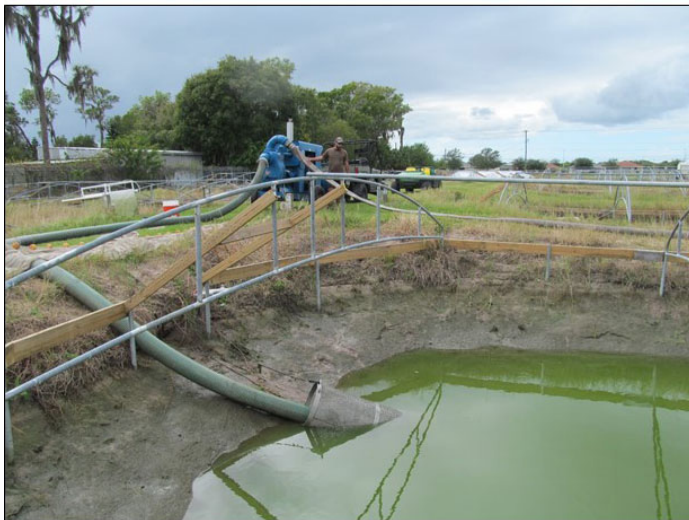
Figure 2. Pond drawdown before fish harvest. A screened basket on the intake hose can be seen in the foreground. This screen can reduce the loss in fish value (lost sales) and also the likelihood of fish escape.