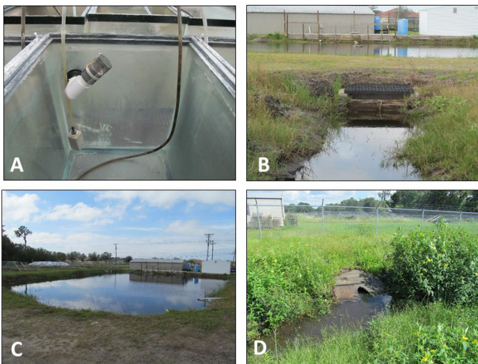
Figure 3. Critical Control Points (CCPs) to prevent non-native species escape at an example facility. A. Screen systems to retain fish inside of greenhouse. B. Control structure separating interior ditch from detention pond. C. Detention pond stocked with predatory fish. Has a control structure as outlet to county ditch. D. Discharge to county ditch.

Different structures vary as well, especially in their ability to contain various species of fish. Livebearers, for example, escape from unscreened tank standpipes and through ditch structures with surface flow (e.g., standpipes or riser boards; Figure 3). This may be due to the fact that many livebearers are surface-oriented and will follow water flow. Research into the effectiveness of different types of barriers on different fish groups would help producers choose appropriate barriers for their facilities.