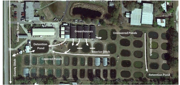
Figure 1. Representative fish farm layout. Water flow direction is indicated by arrows. Effluent from buildings and greenhouses flows into an interior ditch that empties into a detention pond. The detention pond discharges to the county ditch, the only surface water connection between the farm and the outside environment. Ponds are periodically dewatered by pumping into one of the interior ditches. The facility has security fencing, locked gates, and security lighting.

including as fertilized eggs, fry, juveniles, and adults. In practice, free-swimming stages (juveniles and adults) are far more likely to escape.