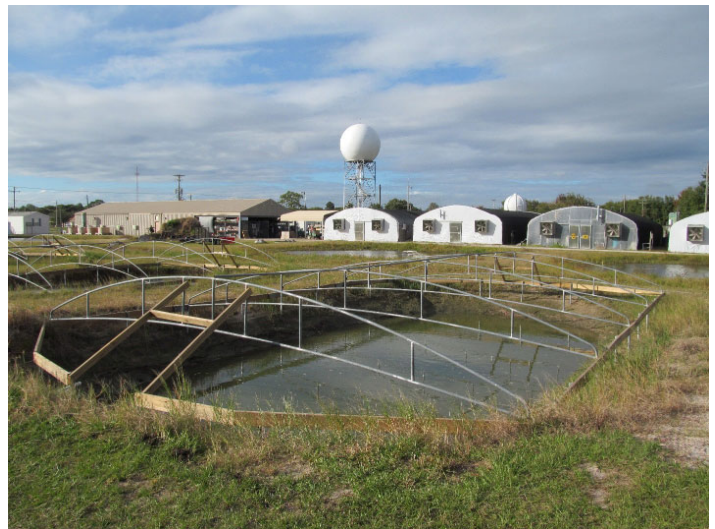
Figure 2. A certified aquaculture facility in Hillsborough County. A pond with support structures to hold bird netting can be seen in the foreground; greenhouses can be seen in the background.

Division of Aquaculture (FDACS). FDACS regulations state that all facility operators engaged in aquaculture with non-zero sales are required to possess the Aquaculture Certificate of Registration, pay a nominal fee (currently $100; expires on June 30 of each year), and also allow facility inspections to determine whether Aquaculture Best Management Practices (BMPs) are implemented (Figures 2 and 3) (FDACS 2015). The Florida Aquaculture Policy Act specifically states: “Any person engaging in aquaculture in the State of Florida must be certified by the department” (Florida Statutes 2013). Maintenance of the Aquaculture Certificate of Registration is one of the most important compliance concerns for aquaculture facility operators.