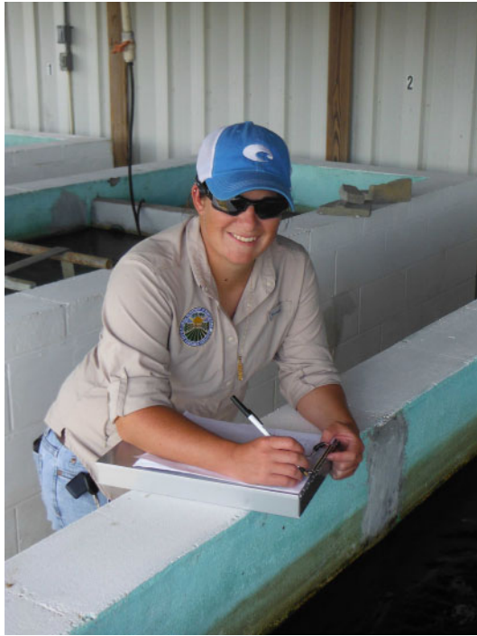
Figure 3. Florida Department of Agriculture and Consumer Services, Division of Aquaculture inspector at a certified aquaculture facility.

is necessary because FWC regulations indicate that “No person shall transport into the state, introduce, or possess, for any purpose that might reasonably be expected to result in liberation into the state, any freshwater fish, aquatic invertebrate, marine plant, marine animal, or wild animal life not native to the state, without having secured a permit from the Commission” (FAC 2010); this rule is in force if proper authorization is not obtained from FDACS. Additional rules will apply to the culture of transgenic and restricted species (see Appendix) as well as sturgeon and lionfish (FDACS 2007). Prohibited species are not allowed for commercial culture. Regulations can change, and producers are ultimately responsible for knowing the current state of regulation and for complying with BMPs.