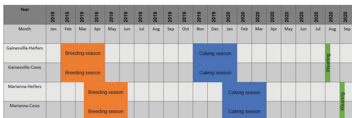
Figure 1. Calendar distribution of the breeding season (orange), calving season (blue), and weaning (green bar) on the UF/IFAS beef herds. In both herds, the breeding season starts when females are artificially inseminated, following a synchronization protocol (Figure 2). Bulls are introduced a few days after AI (Table 1) and removed at the end of the breeding season. The calving season is consistent with the average gestation length in cattle (283 days). Because all females are inseminated on day 1 of the breeding season, AI calves are born first and calves from natural service follow.

Producers always ask what numbers they should aim for. There is no definitive answer, because different performances are expected from different production systems. Producers may find it useful to utilize the numbers from this report as a reference point to gauge the reproductive performance of their operations. To that end, it is always useful to look at real numbers obtained from reliable sources. Here, we present a yearly report of the reproductive performance of the University of Florida beef herds. Each University herd operates according to its respective regional characteristics and specific management (Table 1 and Figure 1). Figure 2 presents the synchronization protocol, reproductive performance, pregnancy maintenance, and calf survival data for both the Gainesville (UF/IFAS Beef Unit) and the Marianna (UF/IFAS North Florida Research and Education Center) herds for the 2019 breeding season/2019–2020 calving season.