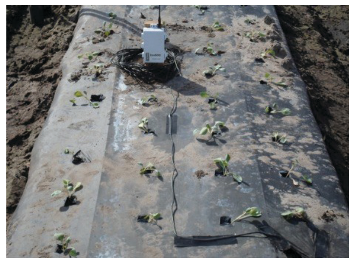
Figure 6. Soil moisture sensors installed under plastic mulch in both inner and outer plant rows.

The information gathered by these sensors was saved every 15 minutes onto a drive. The drive in the plasticulture profile was connected to a cellular data network, like a cellular phone. The plasticulture data were uploaded onto the