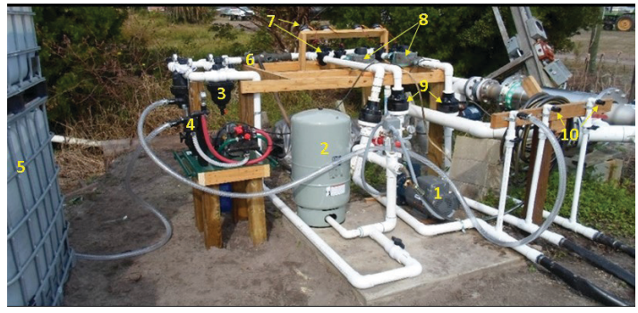
Figure 3. Overview of the irrigation well and manifold for drip irrigation.

The next component in the manifold is the double check valve. A double check valve or back flow prevention system is mandatory on any irrigation system in which chemicals are to be injected into the water line to prevent contamination of the water supply. (For more information on back flow prevention see EDIS Circular 1403, Chemigation Equipment and Techniques for Citrus. )