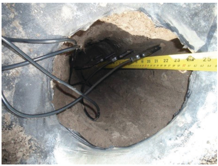
Figure 5. Top view of soil moisture sensors installed under plastic mulch at 4", 8", 16", and 24" depths.

Soil moisture sensors can be very useful for understanding the daily, weekly, and monthly dynamics of soil moisture in the plant root zone. For this demonstration we installed two sensor profiles, one in seepage and one under drip. Each profile consisted of five soil moisture sensors, placed in the plant row. The sensors were installed at four depths with two at 4", and one sensor at 8", 16", and 24" (Figure 5). Two sensors were placed at the 4" depth to get an average at that depth because soil moisture at 4" can be quite variable in sandy soils. Also, in the plasticulture profile the two 4" probes were placed such that one probe was installed into an inner plant row and one into an outer plant row (Figure 6).