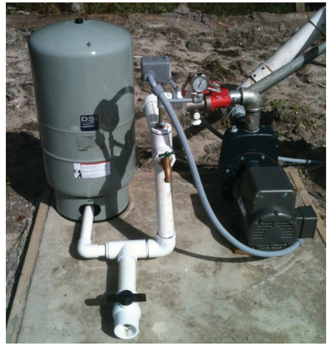
Figure 2. Pressure tank, 5-hp pump, 2" galvanized drop pipe, and red cycle stop valve.