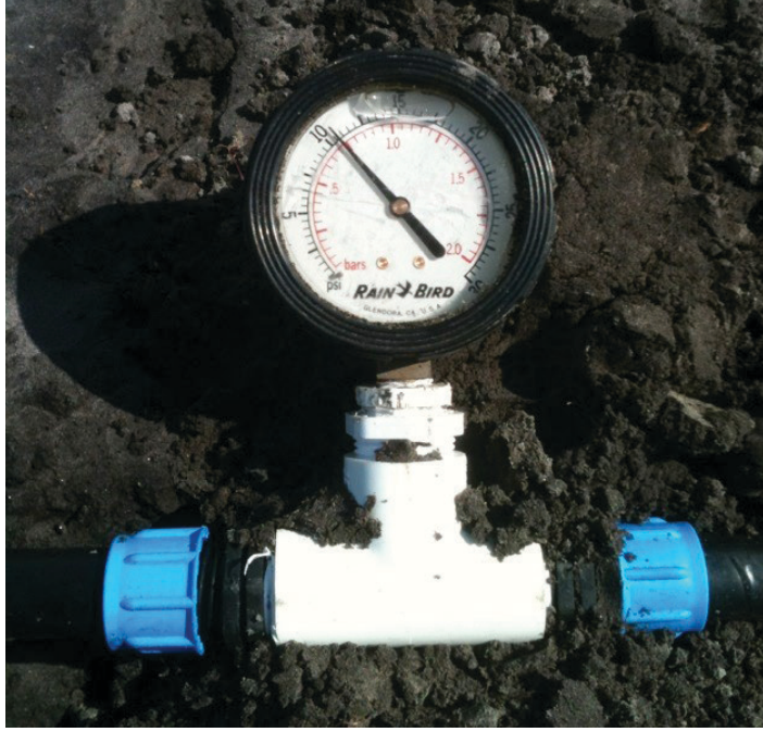
Figure 4. Water pressure gauge installed in-line in the drip tape over 1,300 ft from the irrigation manifold showing a pressure greater than 10psi.

of the irrigated zones, furthest from the pump (Figure 4). With 15 psi at the beginning of the irrigated zones, there was over 10 psi at the end of the 1,300 ft. long zones.