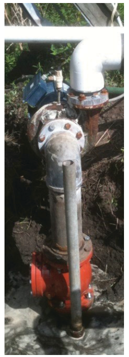
Figure 1. The 2" drop pipe (galvanized) installed below red check valve of original 6" well.

relation to the amount of water the system is demanding. With a cycle stop valve, back pressure is applied to a pump and the pump still runs as it normally would but at a lower amperage. A cycle stop valve helps the pump maintain constant pressure without cycling on and off by matching the flow of water demanded by the system to the flow of water coming from the pump. The pressure tank and cycle stop valve work together to keep constant pressure on the irrigation supply line. Constant water pressure and water on demand allowed for the separation of the irrigated crop area into zones.