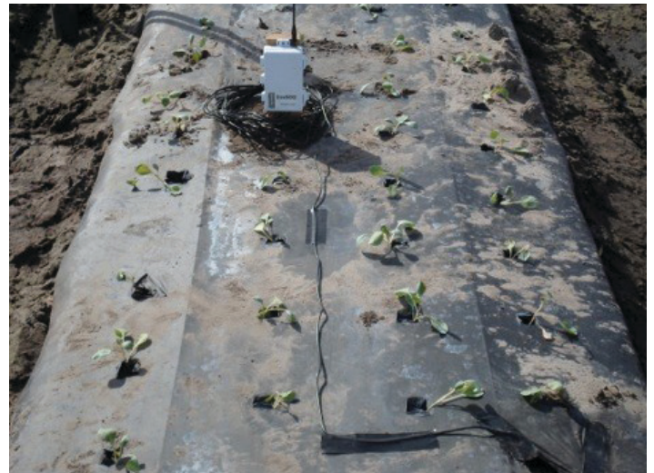
Figure 6. Soil moisture sensors installed under plastic mulch in both inner and outer plant rows.

The information gathered by these sensors was saved every 15 minutes onto a drive. The drive in the plasticulture profile was connected to a cellular data network, like a cellular phone. The plasticulture data were uploaded onto the