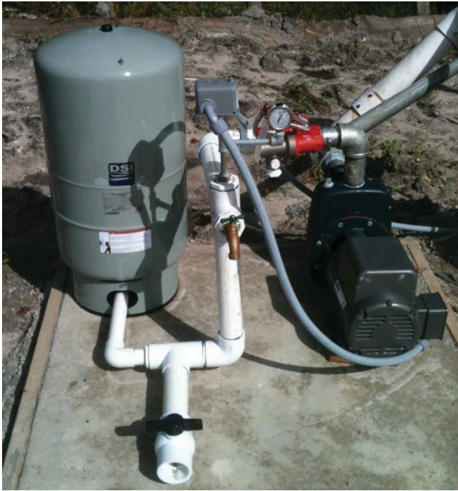
Figure 2. Pressure tank, 5-hp pump, 2" galvanized drop pipe, and red cycle stop valve.