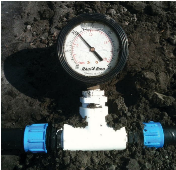
Figure 4. Water pressure gauge installed in-line in the drip tape over 1,300 ft from the irrigation manifold showing a pressure greater than 10psi.

of the irrigated zones, furthest from the pump (Figure 4). With 15 psi at the beginning of the irrigated zones, there was over 10 psi at the end of the 1,300 ft. long zones.