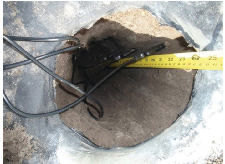
Figure 5. Top view of soil moisture sensors installed under plastic mulch at 4", 8", 16", and 24" depths.

Soil moisture sensors can be very useful for understanding the daily, weekly, and monthly dynamics of soil moisture in the plant root zone. For this demonstration we installed two sensor profiles, one in seepage and one under drip. Each profile consisted of five soil moisture sensors, placed in the plant row. The sensors were installed at four depths with two at 4", and one sensor at 8", 16", and 24" (Figure 5). Two sensors were placed at the 4" depth to get an average at that depth because soil moisture at 4" can be quite variable in sandy soils. Also, in the plasticulture profile the two 4" probes were placed such that one probe was installed into an inner plant row and one into an outer plant row (Figure 6).