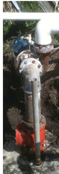
Figure 1. The 2" drop pipe (galvanized) installed below red check valve of original 6" well.

relation to the amount of water the system is demanding. With a cycle stop valve, back pressure is applied to a pump and the pump still runs as it normally would but at a lower amperage. A cycle stop valve helps the pump maintain constant pressure without cycling on and off by matching the flow of water demanded by the system to the flow of water coming from the pump. The pressure tank and cycle stop valve work together to keep constant pressure on the irrigation supply line. Constant water pressure and water on demand allowed for the separation of the irrigated crop area into zones.