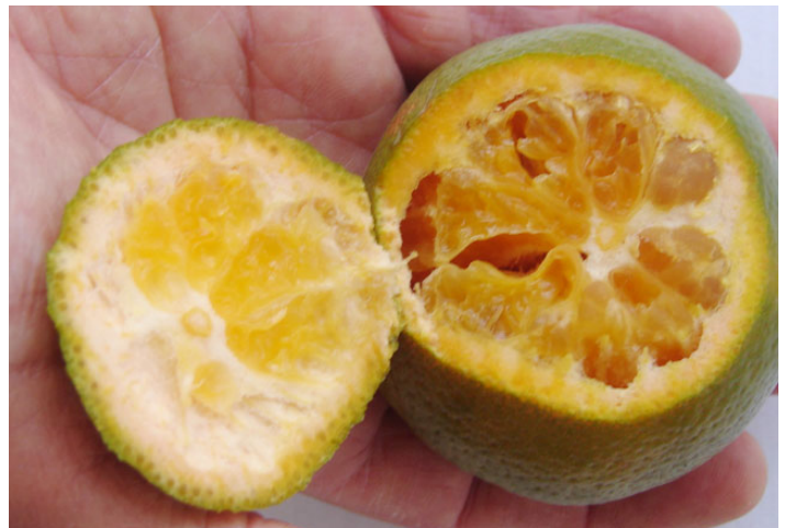
Figure 8. Extensive internal injury following a severe freeze.