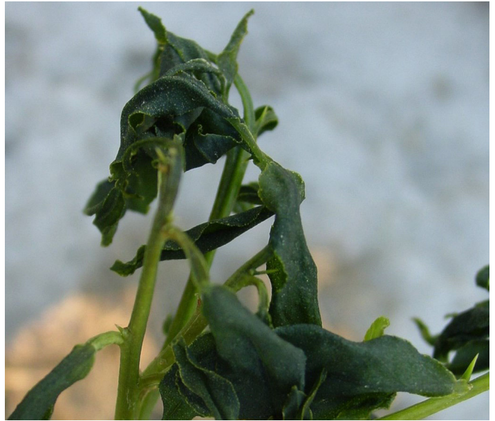
Figure 3. New succulent growth damaged and turning blackish after a freeze event.

Such areas may or may not turn brown after thawing. Completely frozen, killed leaves or tissues within leaves appear bleached or tan to brown in color (Figures 2a, 2b). New succulent growth, when frozen, will often turn blackish in color instead of brown upon thawing (Figure 3). Leaf drop within a few days indicates that the wood is likely not damaged or killed (Figure 4), while leaf retention on the twigs usually indicates wood kill. Wood damage can be checked by scraping the outer layer of bark. Green tissue in most (but not all) cases indicates live wood, while brown tissue implies freeze-damaged dead wood. Ice formation may also occur in wood, causing splits in the bark, particularly in young trees (Figure 5). Such splits may be extensive in larger trees resulting in serious injury. Extensive bark splits may cause the limbs to die and later break off many years after the freeze event.