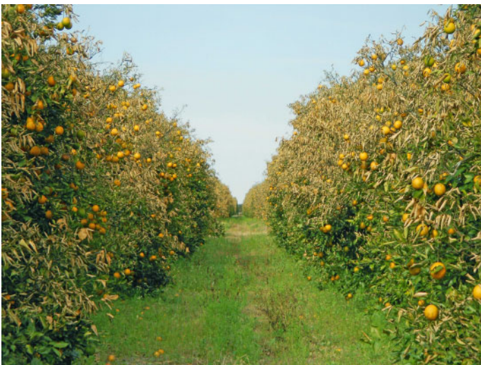
Figure 2b. Tan to brown curled citrus leaves associated with freeze damage.