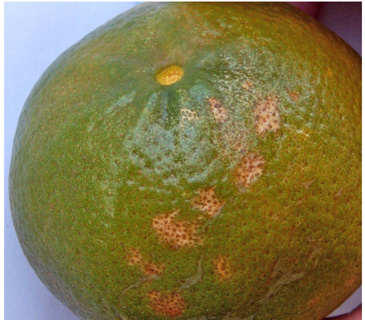
Figure 7. Pitting on citrus fruit peel as a result of freeze damage.

The deeper the ice crystals form, the greater is the injury to the fruit. The frozen area will eventually dry out, leaving the injured fruit partially hollow and lighter in weight than sound fruit of comparable size. Juice loss occurs over a period of several weeks. The amount of overall juice loss is dependent on damage severity and weather conditions following the freeze.