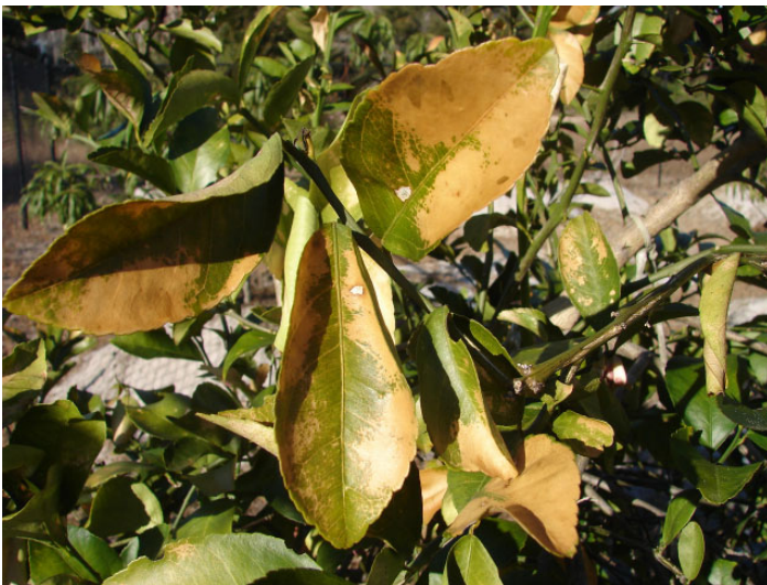
Figure 2a. Bleached brown areas within citrus leaves associated with freeze damage.