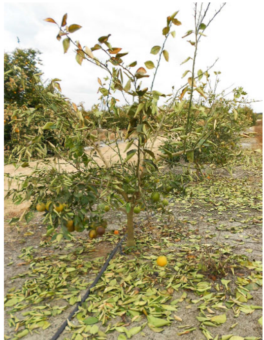
Figure 4. Leaf drop within a few days after a freeze event indicates that the wood is likely not killed.