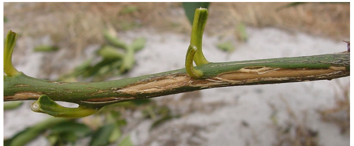
Figure 5. Bark split resulting from freeze injury in citrus.