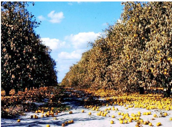
Figure 6. Fruit drop in citrus after a severe winter freeze.

Fruit severely injured during a freeze may drop quickly or may drop more slowly over time, but usually the external appearance of the fruit is not significantly changed (Figure 6). Temples and grapefruit are particularly susceptible to fruit drop, while oranges often remain on the tree for longer periods.