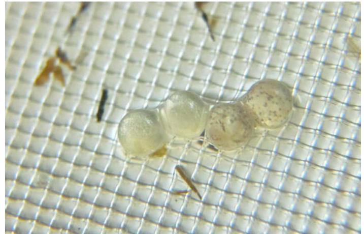
Figure 3. An example of unfertilized eggs (left) and fertilized eggs (right) of Gulf killifish.

to synchronize the hatch of multiple spawns of eggs into a single large cohort of fry. Egg development takes longer at lower temperatures so, by adjusting the incubation temperature of different batches of eggs, they can be hatched simultaneously. For example, eggs collected one week could be incubated at 68°F (20°C) for 18 days, and eggs collected one week later could be incubated at 79°F (26°C) for 11 days. Both batches could then be hatched together and effectively double the size of that production cycle. Air incubation containers should be moistened with saline water (5–18 ppt (g/L)) in order to improve embryo survival and hatch rate. This salinity helps reduce fungal and mold growth on the eggs. The highest hatch rates (70–80%) have been observed at 7–7.5 ppt salinity (Coulon et al. 2012; Brown et al. 2012). Once the embryos are submerged after incubation, a producer can expect 90% hatch within 2 hours and 100% hatch within 24 hours.