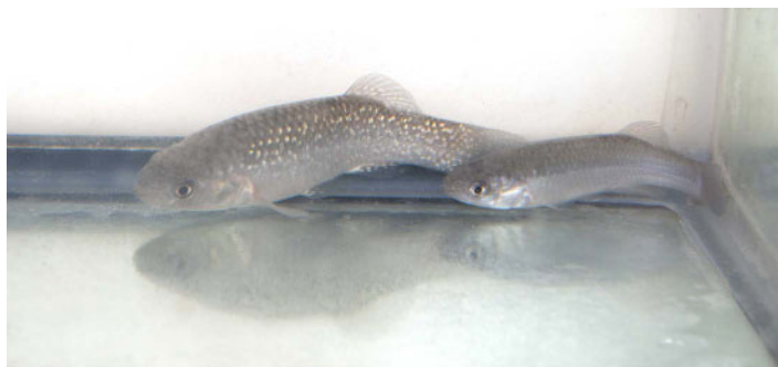
Figure 1. Male (left) and female (right) Gulf killifish, Fundulus grandis .