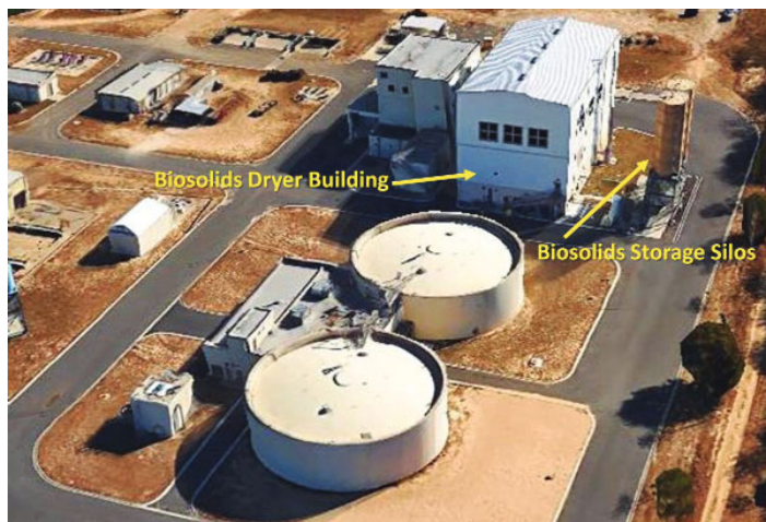
Figure 2. Class AA biosolids dryer and storage facilities, Tallahassee, FL. Credits: Map data ©2015: Google, DigitalGlobe

Processes to further reduce pathogens (PFRP) are considered equivalent options for consistently reducing pathogens below detection limits (Table 4). As described by the US Environmental Protection Agency (EPA), a PFRP must reduce enteric (intestinal) viruses to below 1 plaque forming unit (PFU) per 4 grams of total solids (dry weight basis) and reduce the density of viable helminth ova (parasitic worm eggs) to below 1 per 4 grams of total solids (dry weight basis). In Florida, potential new treatment processes may be reviewed for PFRP equivalency through the federal Pathogen Equivalency Committee (PEC).