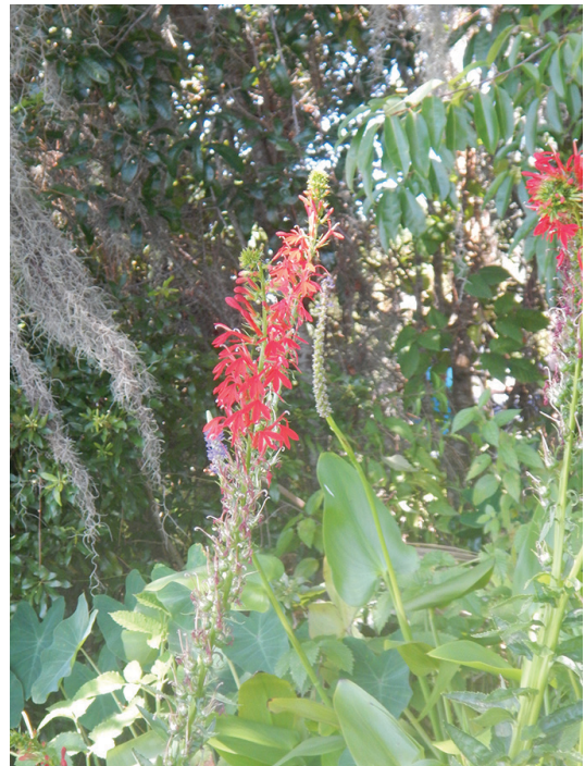
Figure 1. Cardinal flower in the field.

Family: Campanulaceae (Bellflower family) (USDA NRCS 2015)