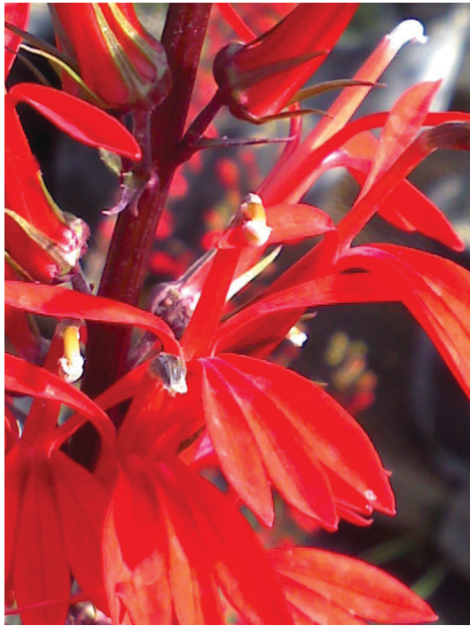
Figure 2. Flowers of cardinal flower.