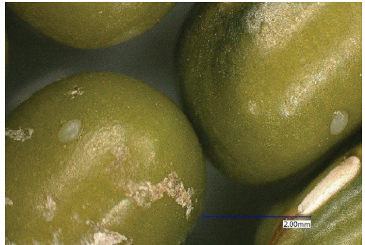
Figure 2. Eggs of Callosobruchus maculatus . (Pointed by yellow arrow at magnification 50X.

The egg hatches, and the larva (whitish color; Figure 3) bores inside the seed. Once the larva gets inside, the eggshell turns opaque as it gets filled with the larval frass (Devereau et al. 2003). It has four larval instars before turning into the pupa.