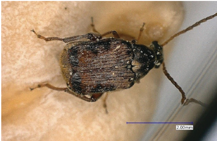
Figure 5. Male Callosobruchus maculatus , red circle is showing the abdominal plate at magnification 50X.

The adult Callosobruchus maculatus chews the seed coat and emerges out of the seed. The adult is metallic in color with some pale spots/stripes. The head of the male and female is black, and the wings are brown with black patches. The male (Figure 5) and female (Figure 6) can be distinguished by the plate's color at the abdomen's end. In the female, the plate is large and colored black on the sides with a white longitudinal line, while in the male, it is smaller and lacks strips. The adults become sexually mature after 24- 48 hours of emergence. The adult lives for two-three weeks. (Beck and Blumer 2014).