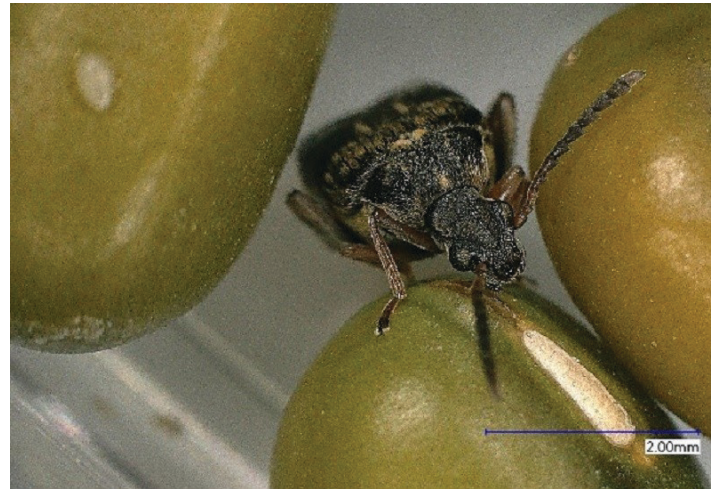
Figure 1. Female Callosobruchus maculatus feeding on Mung bean ( Vigna radiata ) at magnification 50X.

Callosobruchus maculatus is a cosmopolitan pest. Biogeographically, the species originated in Africa. It later spread to tropical and sub-tropical parts of the world (Beck and Blumer 2014).