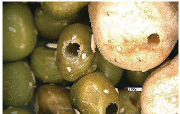
Figure 7. Damage of Callosobruchus maculatus at magnification 20X.

Callosobruchus maculatus is a serious economic pest of stored legumes and seed infestation starts in the field. Feeding injury by the developing Callosobruchus maculatus larvae reduces the amounts of carbohydrates and proteins of the grain, leading to the degradation of the nutritional quality and forcing the growers to sell their commodity with low economic value after harvest (Allotey and Oyewo 1993, Murdock et al. 2003). It is estimated that the economic losses caused due to Callosobruchus maculatus infestation in stored grain legumes are 35%, 7–13%, and 73% in Central America, South America, and Kenya, respectively (Nahdy 1994 and Hu et al. 2009). Legume seeds stored for six months can experience 70% seed infestation and about 30% yield loss, leaving them unacceptable for human consumption (Singh and Jackai 1985). However, there is not enough information about the economic injury level (EIL) of Callosobruchus maculatus under storage conditions (Hamdi et al. 2017). Callosobruchus maculatus is used for rearing biocontrol agents such as the hymenopteran Catolaccus hunteri of pepper weevil ( Anthonomus eugeni ). (Vásquez et al. 2005).