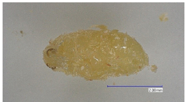
Figure 4. Pupa of Callosobruchus maculatus at magnification 50X.

The pupa is whitish, about 3.87 mm long and 1.76 mm wide at 50X (Figure 4). When the larva starts to pupate, the seed's shell starts turning thinner (Beck and Blumer 2014).