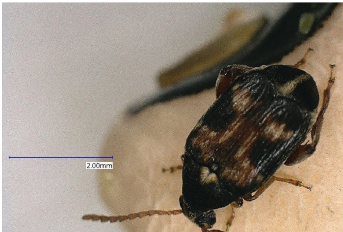
Figure 6. Female Callosobruchus maculatus , red circle is showing the abdominal plate at magnification 50X.