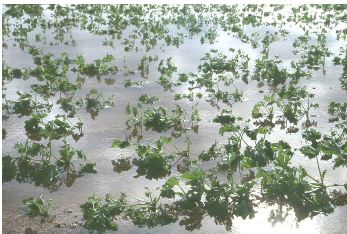
Figure 2. Flooded squash plants.