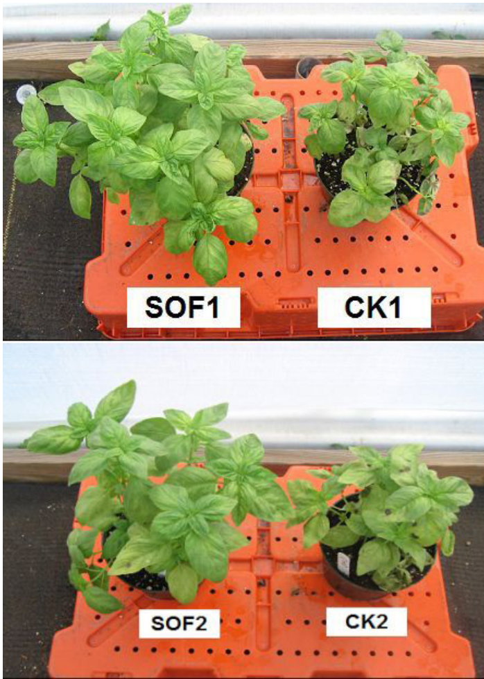
Figure 3. Growth differences in flooded Italian basil with and without oxygen fertilization. SOF = solid oxygen fertilizer. CK = control.