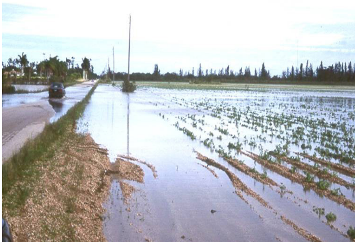
Figure 1. Flooded squash field.