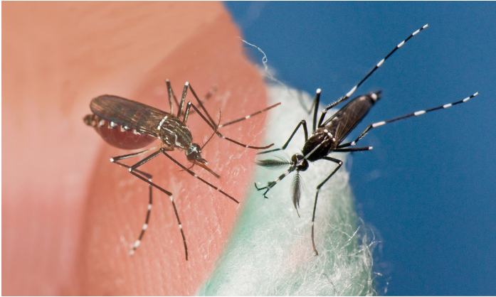
Figure 1. The invasive mosquitoes Aedes aegypti (left) and Aedes albopictus (right) occur in the Americas, including Florida, and have been implicated in the transmission of Zika virus.