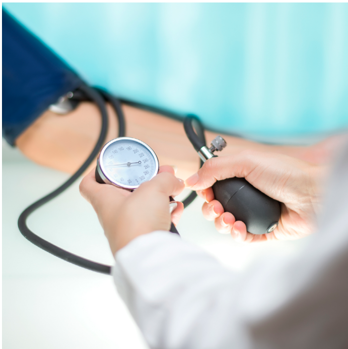
Figure 2. Because high blood pressure usually has no symptoms, you should have your blood pressure measured regularly. Blood pressure is measured with a sphygmomanometer.

If your blood pressure is less than 120/80 mmHg, it is considered normal. If your systolic blood pressure is 120–139 mmHg OR your diastolic blood pressure is 80–89 mmHg, you have prehypertension. This means you are at risk for high blood pressure and you should take steps to lower it. High blood pressure becomes more serious as the numbers increase. The following table shows categories of blood pressure levels in adults.