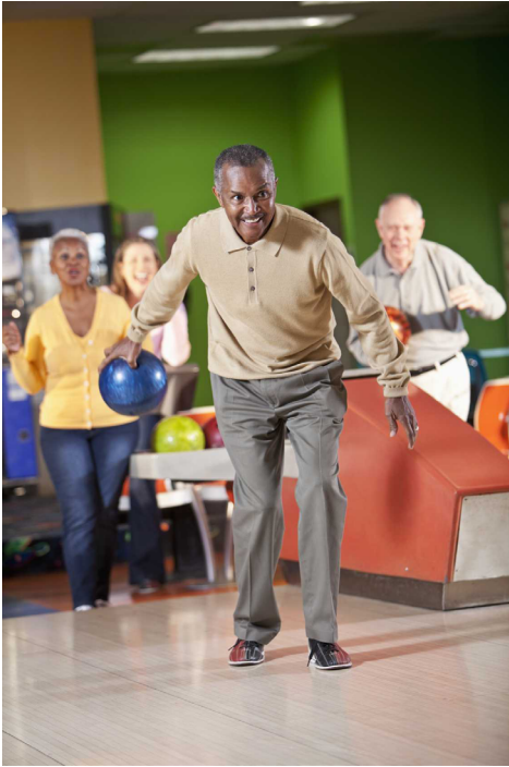
Figure 3. It is easier to stay active when you choose activities that you enjoy doing. Being physically active each day can help reduce your chance of developing high blood pressure.