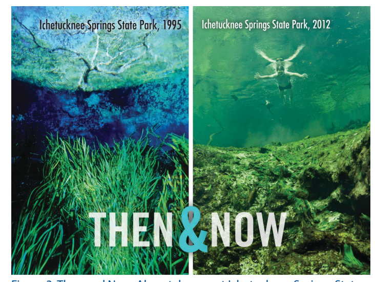
Figure 3. Then and Now. Algae takeover at Ichetucknee Springs State Park, FL, 1997 and 2012. Photos in identical locations.

In areas where the Floridan aquifer is unconfined and overlain by sandy soils, excess nitrate from agricultural lands or septic systems is easily transported into the Floridan Aquifer groundwater supply. More severe cases of nitrate contamination in groundwater can harm human health, which is why the EPA established the Maximum Contaminant Level (MCL) at 10 milligrams of nitrate-nitrogen per liter (mg/l) of water. Ingestion of nitrate-contaminated water and foods is associated with an array of illnesses, including blue baby syndrome (methemoglobinemia) among infants, who are most vulnerable to the potential health impacts of nitrate contamination (WQA 2013). Elevated nitrate levels are of less concern for public drinking water supply, which is drawn from deep in the aquifer and regulated according to the MCL standard (10 mg/l); however, they do pose risk for households reliant on unregulated private domestic wells that draw from shallow groundwater (surficial aquifers) in or near agricultural communities or near septic systems. In addition to potentially harming human health, groundwater contamination can depreciate property values up to 15% where domestic wells supply water (Guignet and Northcutt 2016).