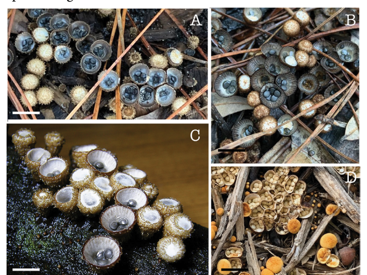
Figure 1. Images of common bird's nest fungi in the United States. A: Cyathus pallidus showing both mature and immature fruiting bodies (MES-3576). Gainesville, Florida. B: Cyathus poeppigii showing both mature and immature fruiting bodies. Gainesville, Florida. C: Cyathus annulatus (NK-50) showing both mature and immature fruiting bodies. Walton, Georgia. D. Crucibulum parvulum (NK-117) showing both mature and immature fruiting bodies. Minneapolis, Minnesota. All scales = 0.5 centimeters.

same order of fungi, called Agaricales, which includes many species of gilled mushrooms.