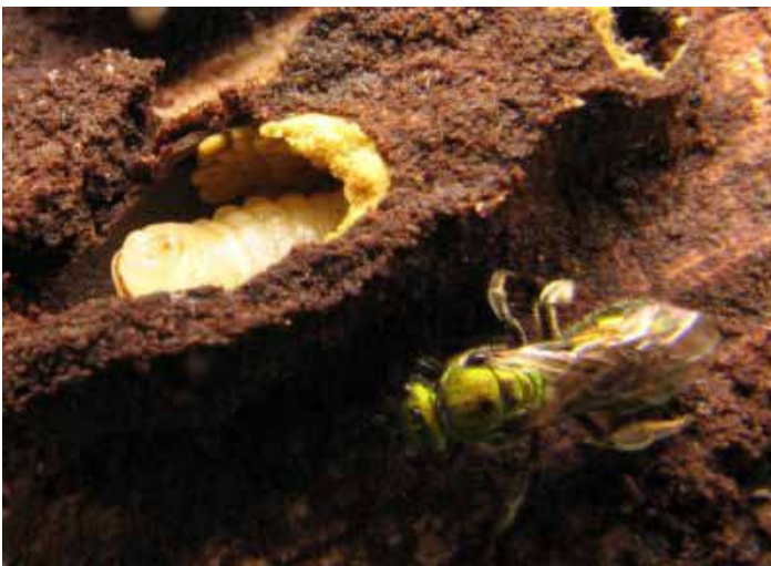
Figure 7. Augochlorini adult standing next to a broken larval cell. The yellow pollen balls lining the cell are created by the female before she deposits the eggs. These provisions then sustain the developing larva until pupation and emergence as an adult.

Most species are polylectic, or gather floral resources from multiple plant species. There are a few oligolectic species and subgenera that feed from a single plant family. Adult halictids eat nectar, and collect nectar and pollen for the larvae. All halictids are mass provisioners, that is, the adults provision each cell with all the food (pollen and nectar) a larva will need until it emerges.