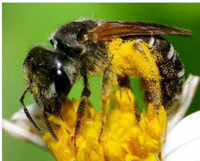
Figure 4. Adult Halictus poeyi Lepeletier, a sweat bee, collecting pollen on Spanish needle, in Highlands County, Florida.

This family of bees can be separated from other families of bees by a strongly curved basal vein in the wing. The genus Lasioglossum can be further separated by weak or reduced wing veins.