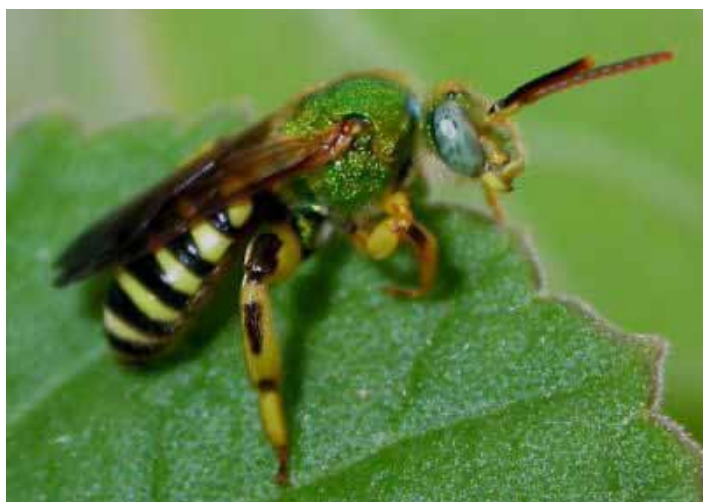
Figure 3. Adult Agapostemon splendens (Lepeletier), a sweat bee.

pollen) and sometimes have a yellow clypeus (sclerite below the antennae on the bee's face). Mature larvae are grub-like in appearance, without setae, and usually less than 15 mm long. Pupae are very delicate and rarely encountered due to their brief developmental period (Michener 2007).