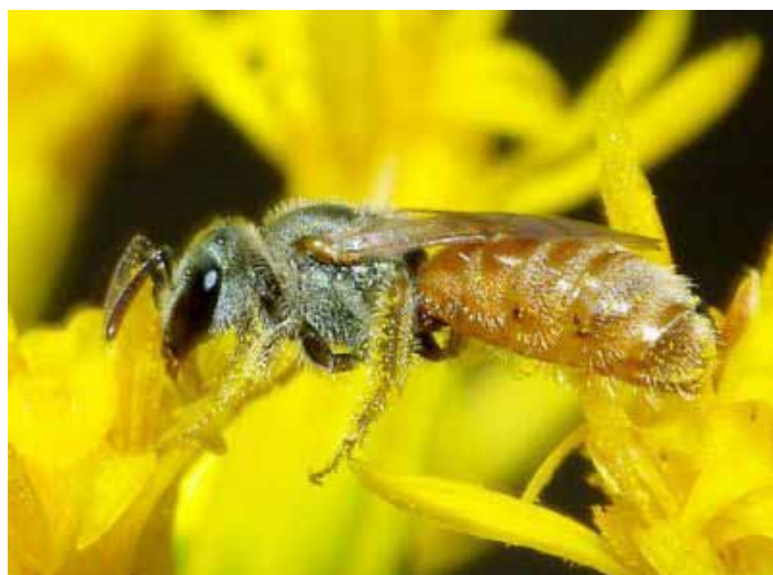
Figure 1. Adult Lasioglossum nymphale Smith, a sweat bee, gathering pollen and nectar on goldenrod. Photograph taken in Highlands County, Florida.

Halictid bees are found worldwide, but are especially abundant in temperate regions. Halictidae is split into four subfamilies: Rophitinae, Nomiinae, Nomioidinae and Halictinae. In Florida, there are 44 species found within eight genera. These genera include: Sphecodes (10 spp. of parasitic bees), Lasioglossum (17 spp.), Nomia (4 spp.), Agapostemon (2 spp.), Augochloropsis (3 spp.), Augochlora (1 sp.), Augochlora (3 spp.) and Halictus (4 spp.) (Pascarella 2006). Most of these species are also common throughout the eastern United States.