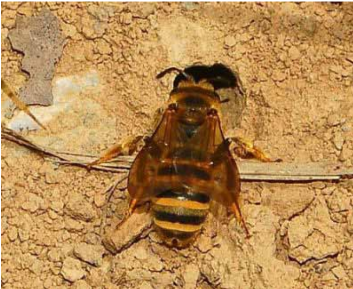
Figure 9. Adult Halictus scabiosae Rossi, a sweat bee, entering her nest entrance. Photograph taken in Genova, Italy.

kills the other egg or larva before eating the host's stored food (Michener 2007).