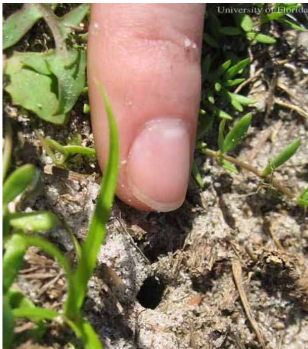
Figure 10. Typical nest entrance for Augochlorini, a tribe (group of genera in a subfamily) of sweat bees.