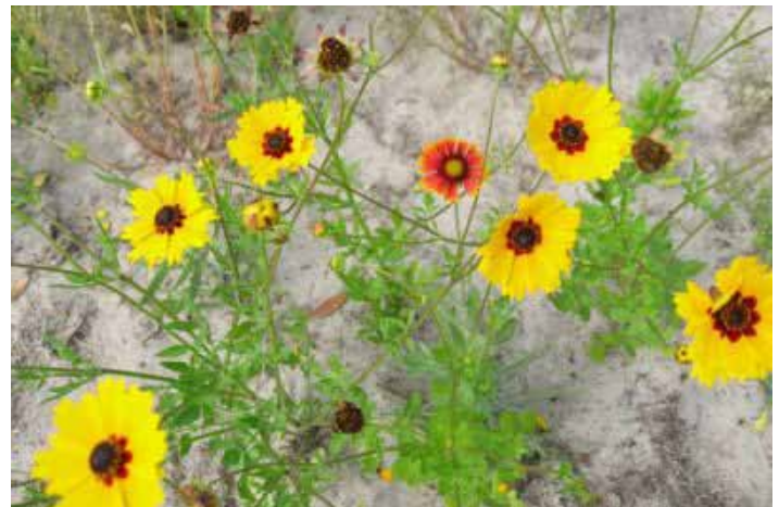
Figure 12. Wildflowers with exposed soil for nesting, a typical habitat for sweat bees.

The family Halictidae contains a few social parasites and cleptoparasitic bee genera. These include Sphecodes , Microsphecodes and Lasioglossum . Sphecodes is parasitic on Halictus spp., while the other two are parasitic on other Lasioglossum spp. Sphecodes females typically kill the egg or larva in the cell before they lay an egg, but in most other cleptoparasitic species, eggs are laid on unfinished cell walls or through sealed cells and the larva of the cleptoparasite