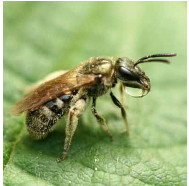
Figure 8. Lasioglossum sp. consuming nectar or water. Photograph taken in Pierce County, Washington.