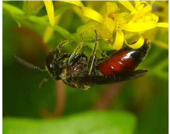
Figure 11. Adult Sphecodes heraclei Cockerell, a parasitic sweat bee, feeding on a flower. Photograph taken in Highlands County, Florida

kills the other egg or larva before eating the host's stored food (Michener 2007).