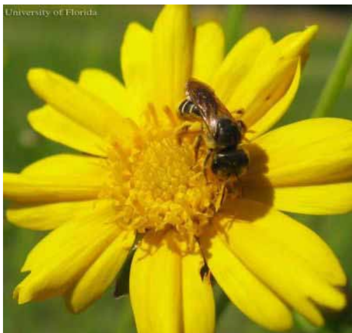
Figure 2. Adult Halictus poeyi Lepeletier, a sweat bee, gathering pollen on lanceleaf coreopsis, Coreopsis lanceolata .

pollen) and sometimes have a yellow clypeus (sclerite below the antennae on the bee's face). Mature larvae are grub-like in appearance, without setae, and usually less than 15 mm long. Pupae are very delicate and rarely encountered due to their brief developmental period (Michener 2007).