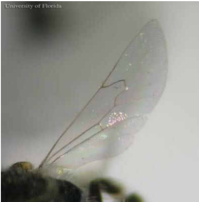
Figure 6. Example of Halictid (sweat bee) wing venation in Lasioglossum , showing weak or reduced wing veins.