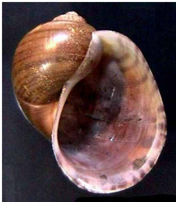
Figure 6. Shell of the titan applesnail, Pomacea haustum (Reeve 1856).

However, it is the channeled applesnail, P. canaliculata (Lamarck 1828), that causes concern to agriculturists. The channeled applesnail has caused significant damage to rice