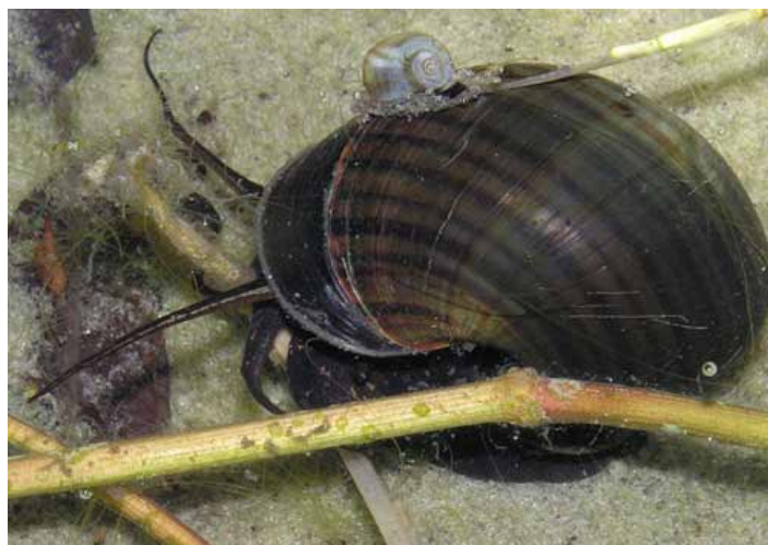
Figure 1. Florida applesnail, Pomacea paludosa (Say 1829).

in the northern tier of Florida counties and northward except where the water is artificially heated by industrial wastewater or in warm springs. It occurs as far west as the Choctawhatchee River. It is easily distinguished from other applesnails in Florida by the low, strongly rounded shell spike, and measures about 40–70 mm (Capinera and White 2011).