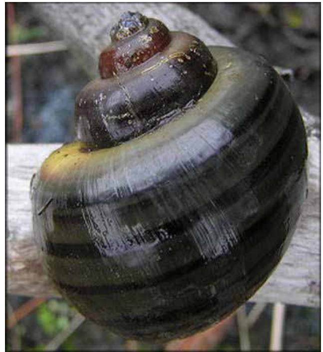
Figure 4. Spike-topped applesnail, Pomacea diffusa Blume 1957.