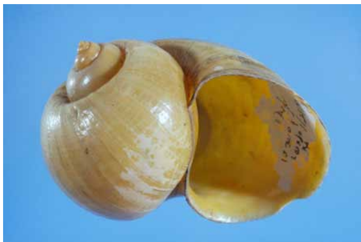
Figure 9. Channeled applesnail, Pomacea canaliculata (Lamarck 1819).

Both the island and channeled applesnails are potential threats to Florida's aquatic ecosystems. It is not known whether these two species have similar feeding preferences (FFWCC 2006).