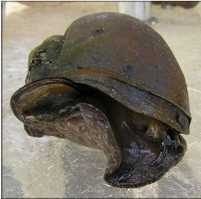
Figure 2. Adult island applesnail, Pomacea insularum (d'Orbigny 1839).