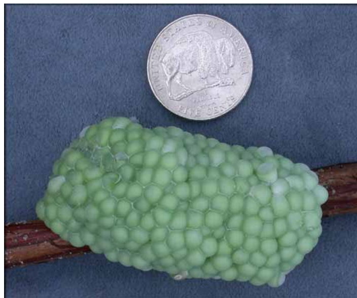
Figure 7. Egg mass of the titan applesnail, Pomacea haustum (Reeve 1856).

History at http://www.flmnh.ufl.edu/malacology/fl-snail/snails1.htm .