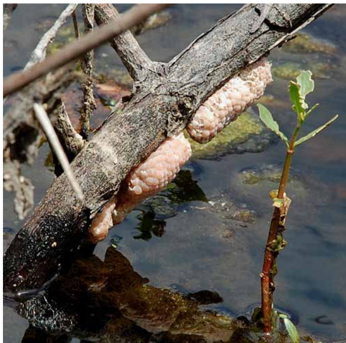
Figure 5. Egg mass of the spike-topped applesnail, Pomacea diffusa (Blume 1957).