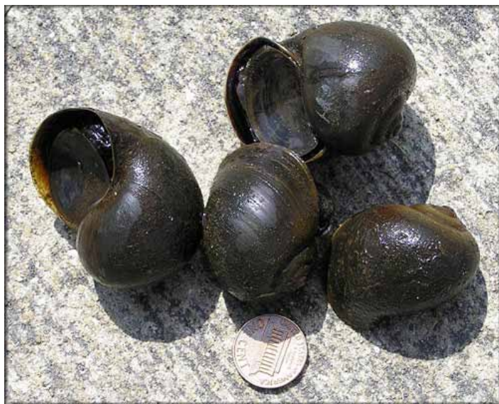
Figure 8. Florida applesnails, Pomacea paludosa (Say 1829). Notice the operculum almost sealing the entrance to the shell in the topmost snail.