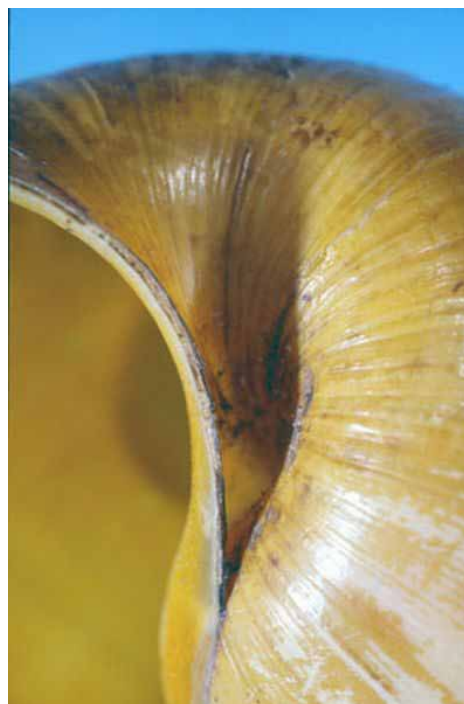
Figure 10. Channeled applesnail, Pomacea canaliculata (Lamarck 1819), showing the deep groove or channel giving it its name.