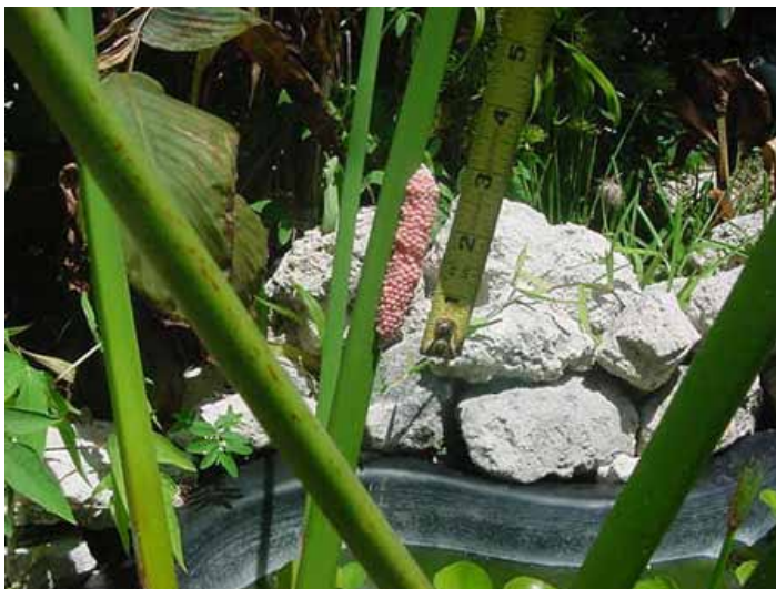
Figure 3. Egg cluster of an applesnail, Pomacea sp., photographed in Gainesville, Florida. Eggs are probably those of the island applesnail, P. insularum (D'Orbigny 1839).