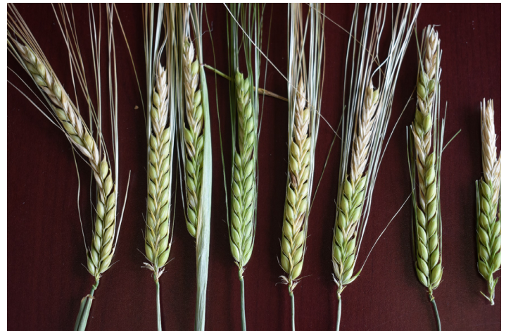
Figure 3. Barley heads with frost damage. Photograph taken 17 March 2020.

fertilizer application rate for the 2019–2020 trial was 115 lb/acre N. This rate was determined after a preliminary study with 90 lb/acre of N showed reduced protein content in harvested grain and low test weight. There was a yield increase in 2019–2020 in comparison to the preliminary study in 2017–2018. Yield ranged from 11–69 bu/acre in 2017–2018, whereas in 2019–2020 yield ranged between 58–96 bu/acre. The variability in yield resulting from frost damage and previous crop history led to no significant differences in yield between the varieties, even with large differences in mean yield and five replications.