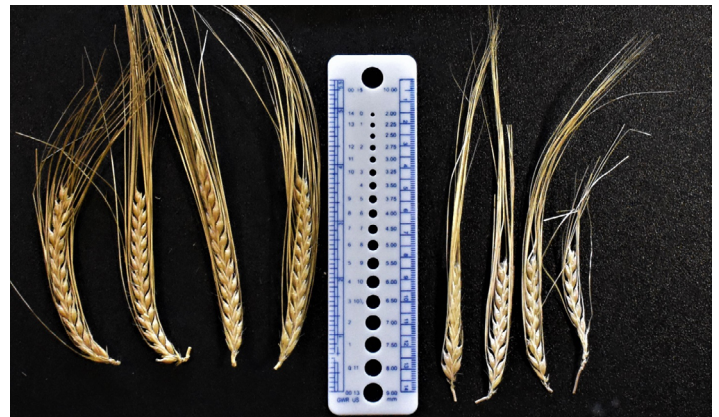
Figure 4. Mature barley seed heads left of ruler and frost-damaged, culled seed heads on right. Photograph taken 05 June 2020 while processing yield samples.