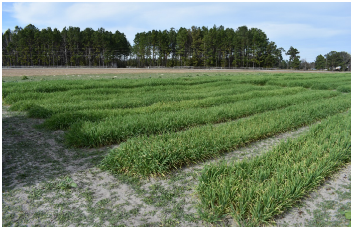
Figure 6. Plot view of crop variability (e.g., variation in plant height) caused by previous crop of peanut planted at approximately 45° to barley plots. Photograph taken 4 February 2020, Live Oak, FL.