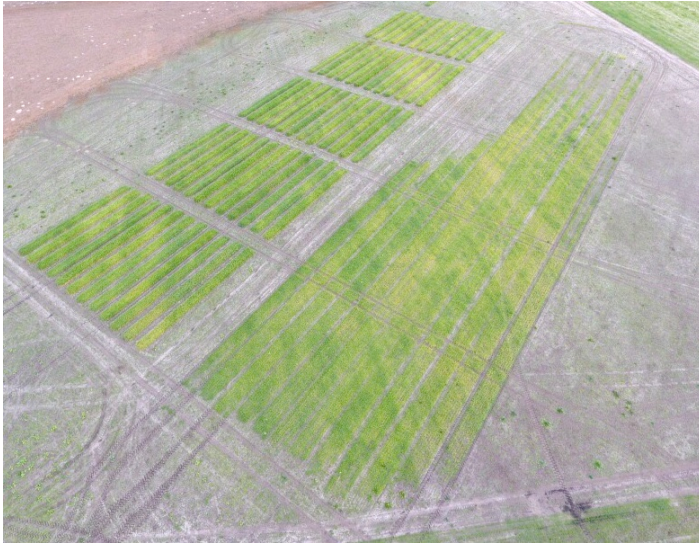
Figure 5. Aerial view of barley plots showing crop variability caused by previous crop of peanut planted at approximately 45° to barley plots. Photograph taken 17 January 2020, Live Oak, FL.

will have to consider their weed-control options and the field history where barley will be planted. Peanut producers should also consider options to evenly spread the peanut vines when harvesting to ensure uniform barley growth.