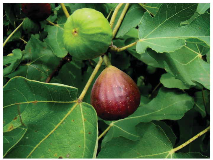
Figure 8. Fruit and leaves of Ficus carica . Credits: Doug McAbee, Flickr.com. Image is licensed by Creative Commons (https://creativecommons.org/licenses/by/2.0/)

Individual psyllid (Hemiptera: Psylloidea) species typically have narrow host ranges. For this group of insects, Burckhardt et al. (2014) proposed that the term "host-plant" should only be used for a plant on which a psyllid species completes its immature to adult life cycle. By this narrow standard, the host plant of Homotoma ficus is Ficus carica (Jerinić-Prodanović 2011), while both Macrohomotoma gladiata and Trioza brevigenae utilize Ficus microcarpa in California (Figures 8 and 9).