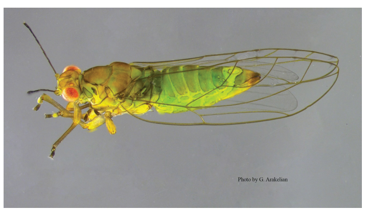
Figure 6. Trioza brevigenae (Mathur) adult.

Trioza brevigenae adults are about 2.6 to 2.8 mm long, with brownish green heads, red protruding eyes, and an abdomen that turns from green to brown with maturity (Hodel et al. 2016, 2020). The wings are transparent, with no patterning, and extend beyond the tip of the abdomen (Figure 6). Hodel et al. (2016) observed adults of this species raising their abdomens and moving them from side to side in a waggling motion. This may be a mate-finding signal, similar in function to the volatile and vibrational signaling used by other psyllid species (Lubanga et al. 2014).