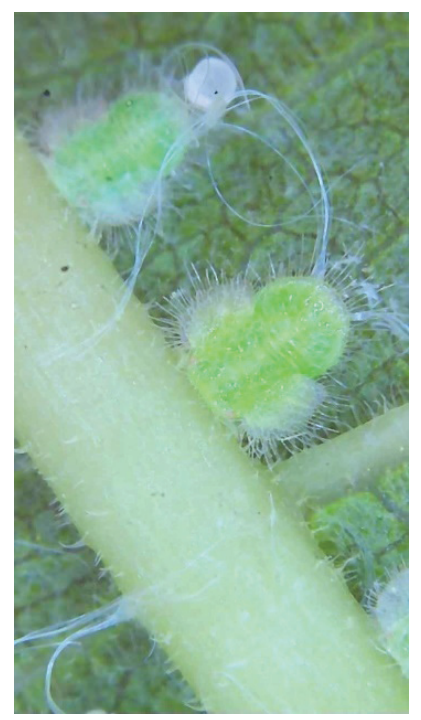
Figure 1. Homotoma ficus L. immatures from France. Credits: J. A. Roch, inaturalist.org. Image is licensed by Creative Commons (https://creativecommons.org/licenses/by-nc/4.0/)

Homotoma ficus adults are light green in color when freshly molted, later becoming brownish with age. Their antennae are densely covered with setae (hair-like structures) and have two dark brown terminal segments. Wings are transparent, with some veins outlined in brown, and body length is approximately 3.25 to 3.8 mm (Jerinić-Prodanović 2011) (Figure 2).