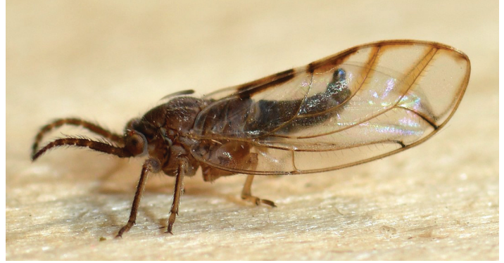
Figure 2. Homotoma ficus L. adult. Credits: Christophe Quintin, Flickr.com. Image is licensed by Creative Commons (https://creativecommons.org/licenses/by-nc/2.0/)