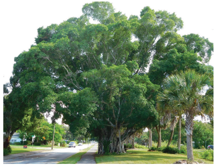
Figure 10. Ficus microcarpa (center) grown as a street tree in Vero Beach, Florida.

Ficus microcarpa, on the other hand, is typically planted as an ornamental, and is a relatively common street tree in south and central Florida (Figure 10). Urban and suburban trees can provide a variety of benefits that are not easily translatable to a fixed dollar value, including increased quality of life, habitat for wildlife, and energy savings from shade (Hilbert et al. 2019). Furthermore, these benefits also are balanced against a mix of potential costs, including damage to property and infrastructure due to growth or storms. If Macrohomotoma gladiata or Trioza brevigenae were to arrive in Florida, they would likely have a significant and aesthetically noticeable effect on their host tree, but the economic impact would be difficult to measure in concrete terms. Fortunately, in California so far, their damage is mostly minor, is visible only when viewed closely, and overall tree health is not much affected. However, Ficus microcarpa often is used as a pruned or clipped hedge, and in these cases M. gladiata can cause patchy but conspicuous defoliation and twig dieback (DR Hodel 2021, personal communication, 11 February 2021).