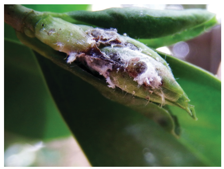
Figure 3. Late instar Macrohomotoma gladiata (Kuwayama) and associated waxy secretions. Credits: Wallace Chen, inaturalist.org. Image is licensed by Creative

Commons (https://creativecommons.org/licenses/by-nc/4.0/)