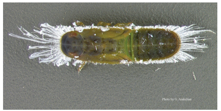
Figure 5. Trioza brevigenae (Mathur), likely fifth instar.

antennae. The fifth and final instar is mobile, 1.9–2.5 mm long, 0.5–6 mm wide, very narrowly oval to oblong, with wing-pads produced slightly beyond the posterior margins of the very small eyes. The head, thorax, and abdomen are distinguishable, and the dark grayish tan to brownish green body is completely ringed around its margin with a distinctive skirt of densely placed, slender, white- waxy filaments, which are shorter on the sides and unusually long at the cranial and caudal ends (Hodel et al. 2020) (Figure 5). The immatures feed on the undersides of young leaves and stimulate a characteristic longitudinal leaf rolling (along the axis of the midvein) that provides a protective refuge for juveniles and adults (Compton et al. 2020).