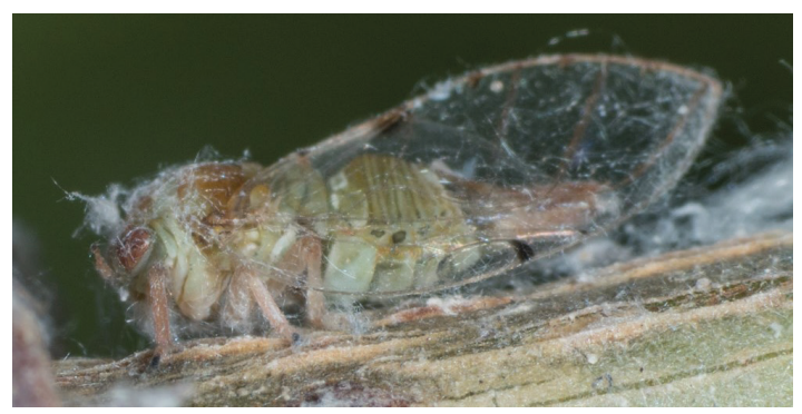
Figure 4. Macrohomotoma gladiata (Kuwayama) adult from California. Credits: Jesse Rorabaugh, inaturalist.org. Image is licensed by Creative Commons (https://creativecommons.org/publicdomain/zero/1.0/)

Macrohomotoma gladiata adults are 2.0 to 3.0 mm long, and green to dark brown, with a pale stripe near the base of the forewing. Their antennae have ten segments, and the wings are transparent with several dark spots (Rung 2016) (Figure 4).