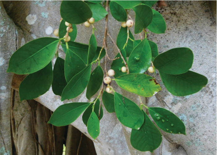
Figure 9. A Ficus microcarpa branch. The leaf galling is caused by another adventive insect species, the wasp Josephiella microcarpae (Beardsley & Rasphus).