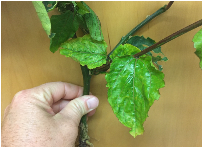
Figure 4. Leaves of passion fruit infected with passion fruit woodiness virus are distorted.

then feeding on an uninfected plant. The virus can also be transmitted through pruning tools and grafting. The virus is not transmitted through seeds. Common cultural practices to manage the disease are selecting virus-free planting materials, eliminating mechanical transmission during trimming, and regularly inspecting and roguing diseased plants. Although there are insecticides to control aphids, prevention is more effective because the virus spreads quickly.