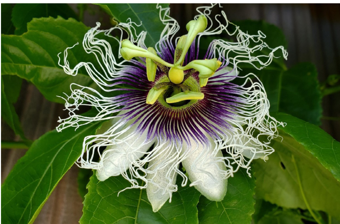
Figure 2. Flower morphology of passion fruit.