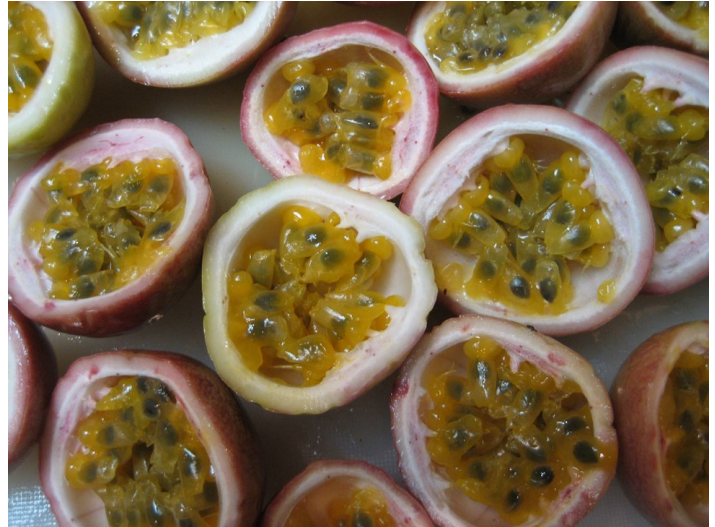
Figure 3. Passion fruit halves with typical aril fill.

Lack of arils (the pulpy tissue surrounding the seed) may be attributed to water or nutrient deficiency. Empty fruit on a passion fruit vine can be a result of excess fertilizer, particularly if large amounts of nitrogen are used. Other reasons may be fruit fly damage, stink bug damage, poor pollination, or boron deficiency (Figure 3).