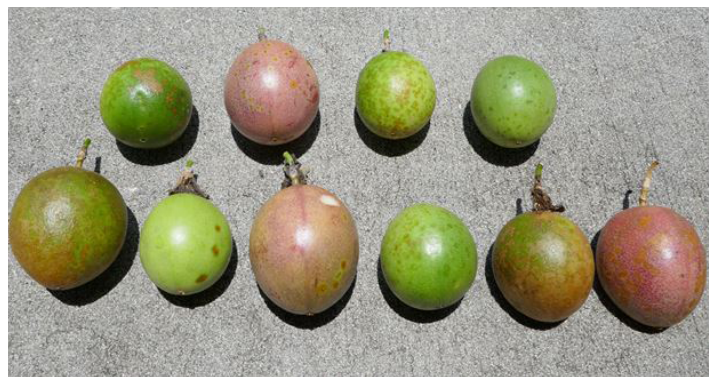
Figure 6. Fusarium affecting fruit at various stages of maturity.

One of the most harmful diseases of passion fruit is fusarium wilt, caused by the fungus Fusarium oxysporum (Figure 6). On young plants, the symptoms include pale-green leaves, mild dieback, leaf drop on lower leaves, and general plant wilting. Yellowing of young leaves appears in adult plants, followed by wilting and death. The disease affects the xylem, causing impermeability of vascular walls and preventing the movement of water to other plant parts. Thus, the vascular tissues become brown at the root, collar, stem, and twig areas. The pathogen can spread by soil movement (machines, implements, shoes, etc.) and by water runoff or irrigation. The disease severity is greater in high relative humidity and temperature.