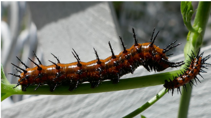
Figure 7. Gulf fritillary caterpillar.