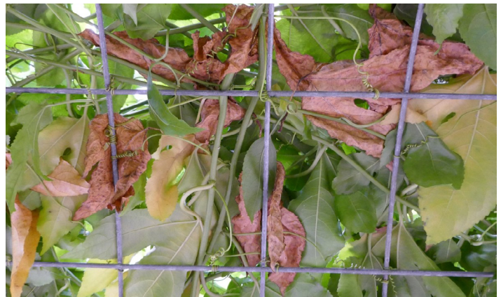
Figure 5. Dead leaves under new leaves hindering airflow and facilitating disease.

Brown spot of passion fruit is caused by the fungi Alternaria passiflora and A. alternata . The symptoms can be seen on leaves, stems, and fruit. On fruit, the symptoms appear as tiny gray spots, then light brown, and finally dark brown with wrinkled centers, affecting the pulp and decreasing commercial value of fruit. The symptoms on the leaves include reddish-brown spots, becoming light brown later. Spots enlarge to one inch in diameter under high humidity. Leaves drop after developing a few spots. On stems, dark-brown lesions are more elongated and cause girdling and eventually death of the terminal part of the stem. Wind, water, and rain can spread the fungal spores produced on the fruit, leaves, and stems. The disease can be more intense under high humidity or high temperature and in the rainy season. Brown spot can be managed by spacing and pruning plants so that air can circulate (Figure 5) and increase ventilation and light conditions. Weed control, improved sanitation, and preventive applications of fungicide can also help to manage the disease.