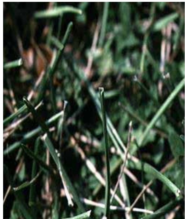
Figure 3. Leaf blades folded in half lengthwise illustrate drought stress.