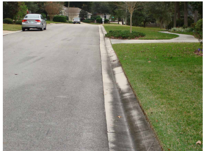
Figure 2. A discoloration of the roadway gutter is a sign of continual wetting from lawn runoff.

Soils are disturbed and compacted when home sites are developed. Heavy machinery and foot traffic cause soil compaction. Even sandy soils can be compacted, but compaction is especially serious when clay is added to the soil as fill during the home or landscape construction process. Compaction problems often are not corrected when the landscape plants and lawns are installed. Water does not easily penetrate compacted soils and may run off the surface, taking soil and associated nutrients with it. This problem can be serious on sloped areas (Figure 2).