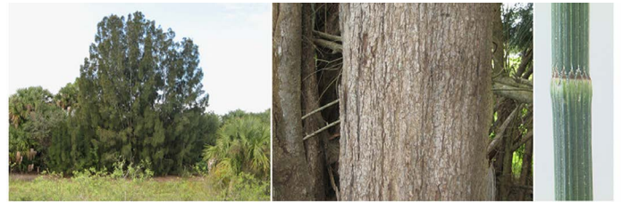
Figure 3. Mature Florida tree, bark and needle of Casuarina glauca .

Seeds are the preferred method of propagation because they are abundant and easy to handle, but germination percentages can vary from 30 to 70% depending on such factors as species, season of harvest and the collection site within the tree canopy (El-Lakany, 1996; El-Lakany et al., 1989; Olsen et al., undated). Poor germination may result from high proportions of shriveled, empty, and insect-damaged seeds that can be separated from “good” seeds by a flotation technique that can improve the germination percentage (Sivakumar et al., 2007). Seeds germinate in 2 to