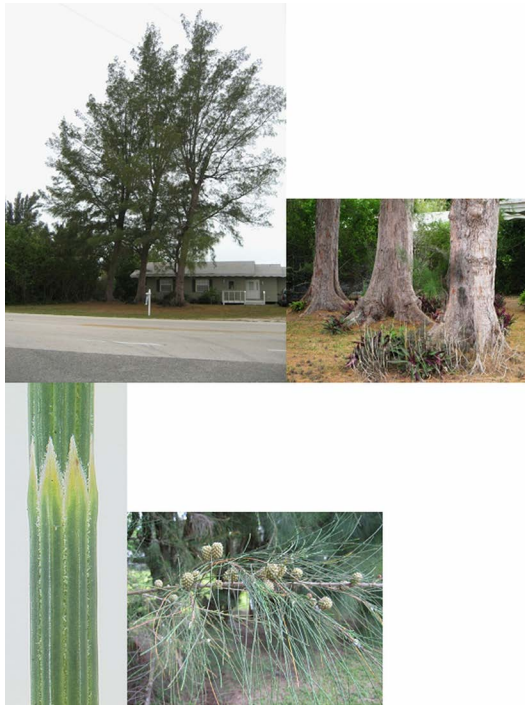
Figure 2. Mature Florida tree, bark, needles and cones of Casuarina equisetifolia .

where they join together. A question remains as to whether this species forms cones in Florida.