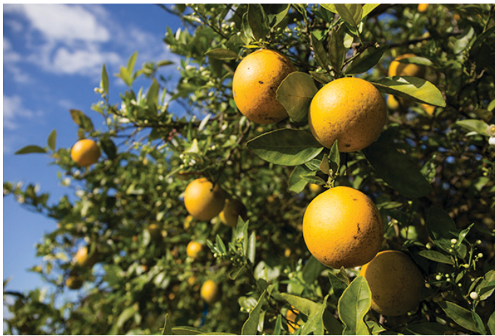
Figure 1. Oranges on trees.

Figure 1 depicts a double pie chart. The larger pie shows the cost of each program as well as the percentage relative to the total cultural production costs with tree replacement. The smaller pie in Figure 2 provides greater detail regarding the individual components included in the foliar sprays. Insecticides accounted for $194.79 per acre, representing 11% of the cultural cost of production; fungicides accounted for $43.51 per acre (3%); foliar nutritionals for $115.86 per acre (7%); aerial application totaled $18.45 per acre (1%), and ground application of materials was $139.34 per acre (8%).