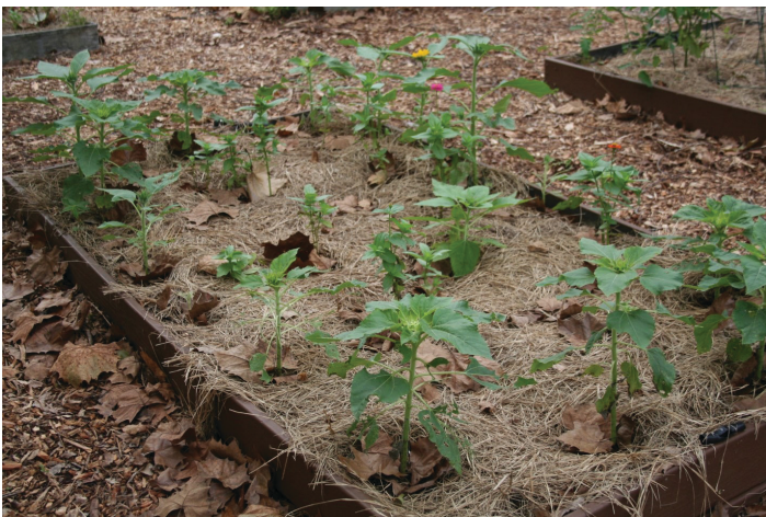
Figure 4. A garden bed planted in rows for easy cultivation and space to grow.