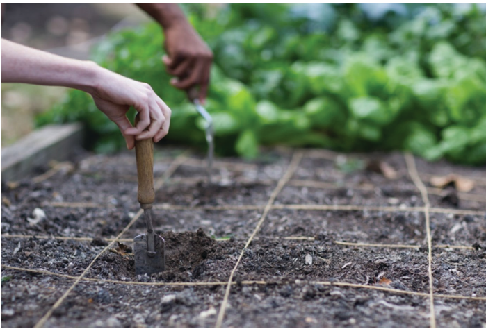
Figure 3. A garden bed with string marking rows for even planting.