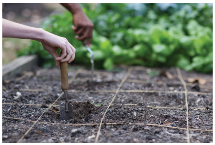
Figure 3. A garden bed with string marking rows for even planting.