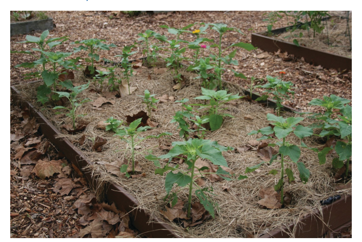
Figure 4. A garden bed planted in rows for easy cultivation and space to grow.